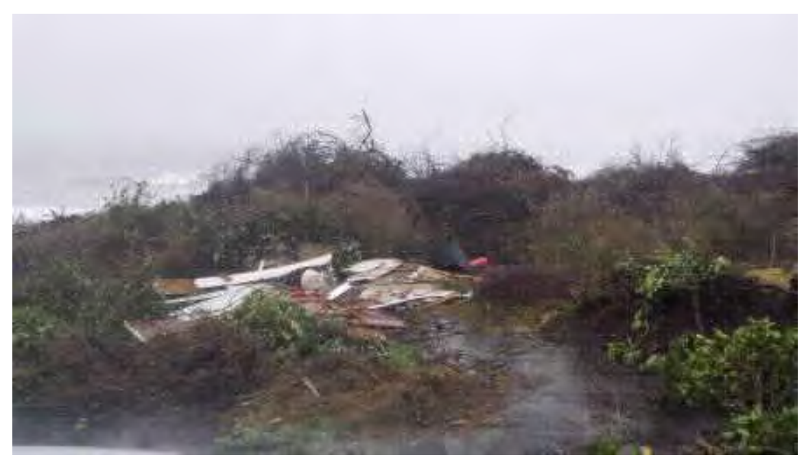
Photo 1 Unacceptable materials in the drop off area at inspection on 4 August 2015

It appeared that contractors were regularly removing material from the site that would not be authorised for discharge to the dunes (as materials present at the previous inspection had been removed). It was noted that two piles of unacceptable mixed organic/inorganic material had recently been deposited in the drop off area, including a large tree stump (Photo 1 and Photo 2).