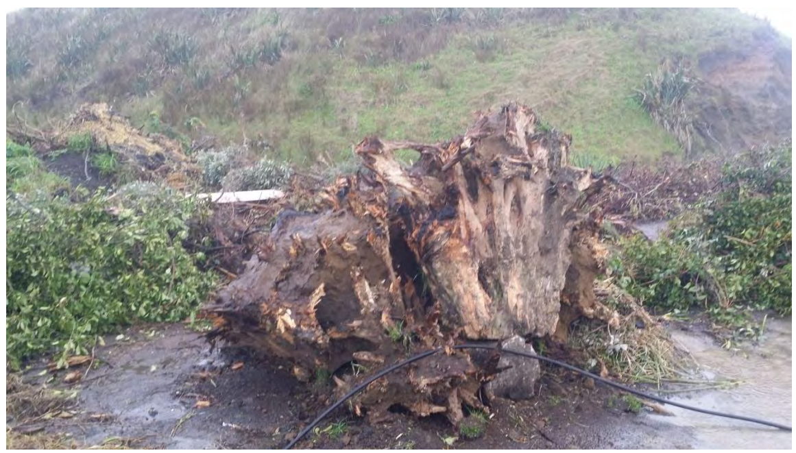
Photo 2 Unacceptable materials in the drop off area at inspection on 4 August 2015

There were no issues noted in regards to odour and it was reported that the site was well drained considering the weather conditions at the time of inspection. The following action was to be taken: