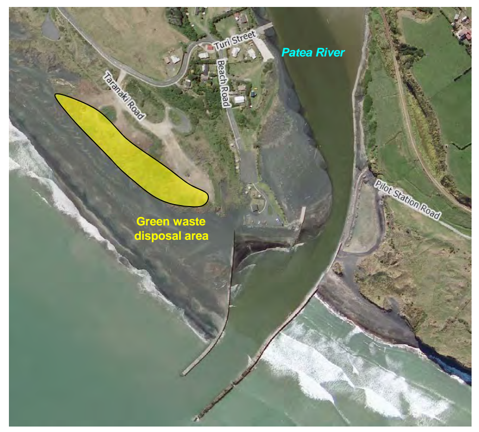
Figure 2 Aerial view of the Patea Beach green waste disposal area