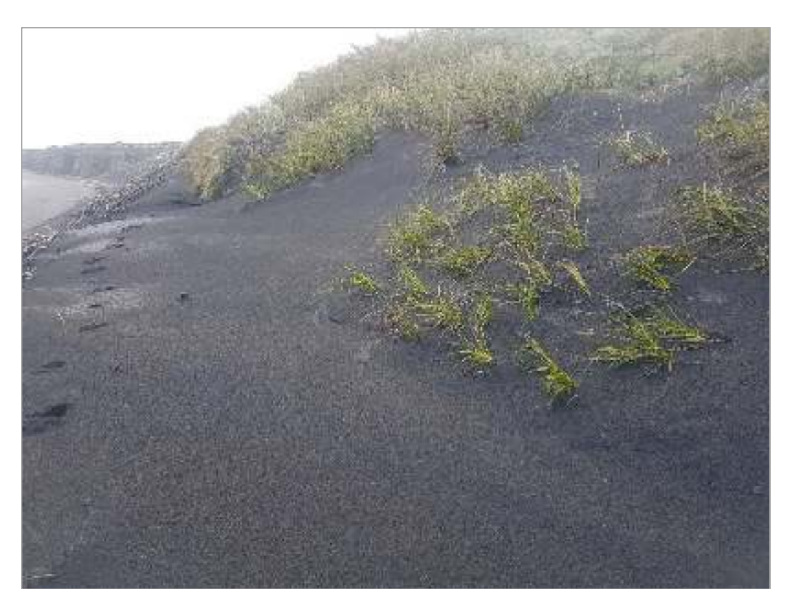
Photo 1 Grass species establishing along old green waste discharge area