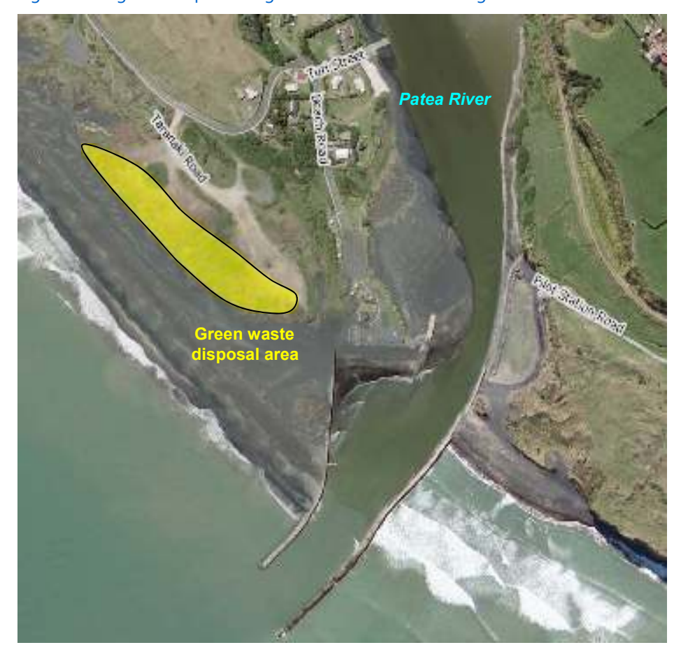
Figure 2 Aerial view of the Patea Beach green waste disposal area