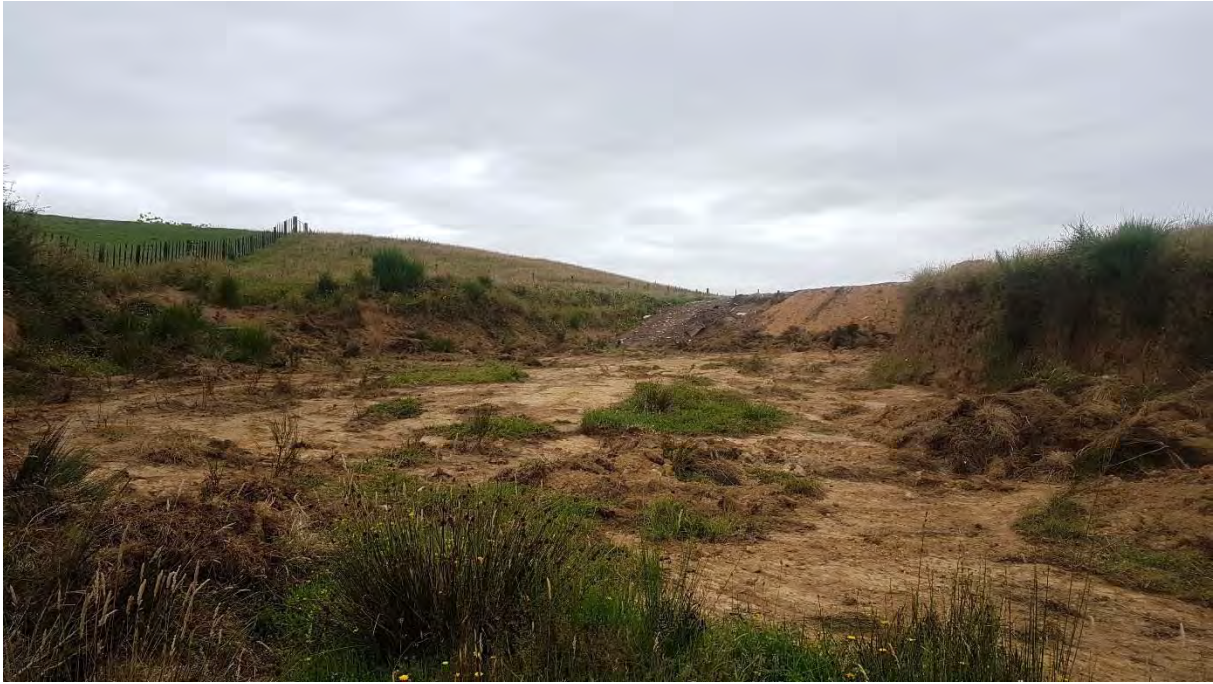
Photo 2 Value Timber Ltd pre-fill gully