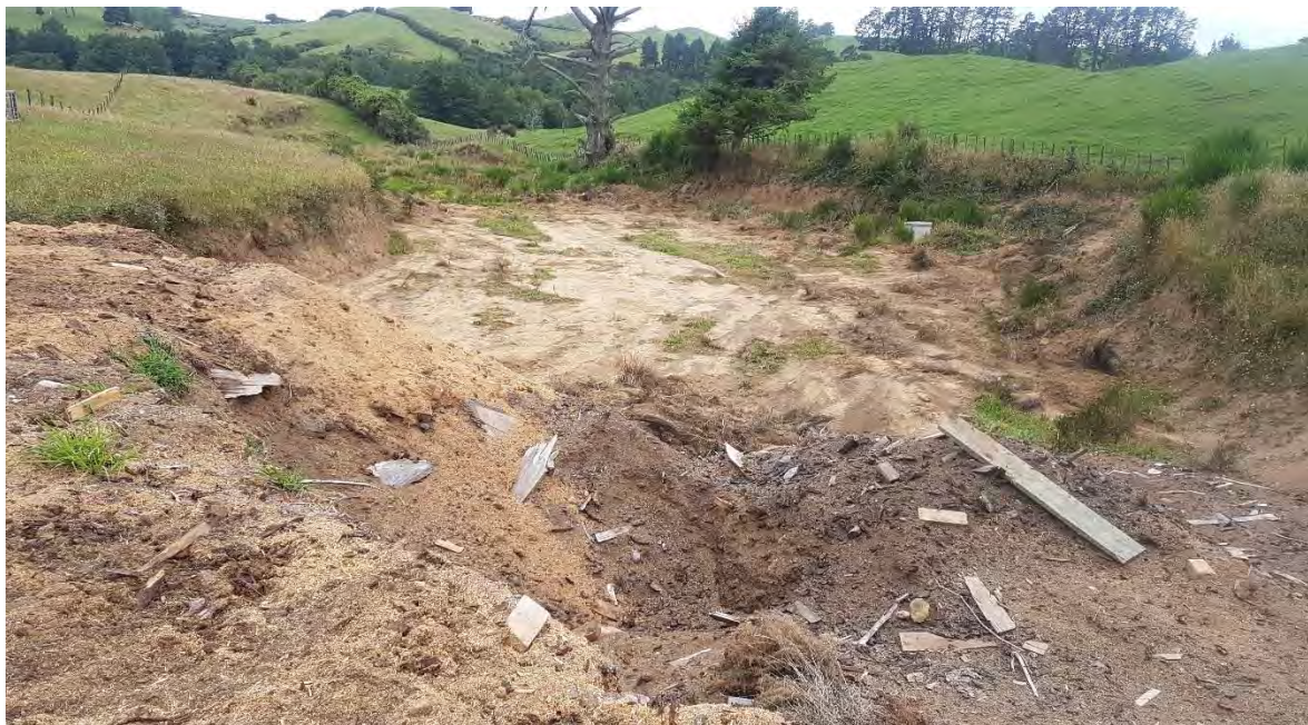
Photo 1 Value Timber Ltd wood waste fill area January 2018

The stormwater drains were clear and dry, while the stormwater ponds were clear, near empty and not discharging. Silt controls were in place downstream, and were operating satisfactorily. The stream was flowing at a low, slow rate. The site was well fenced and secure, with no sign of stock grazing in the gully. There were no odour or dust issues.