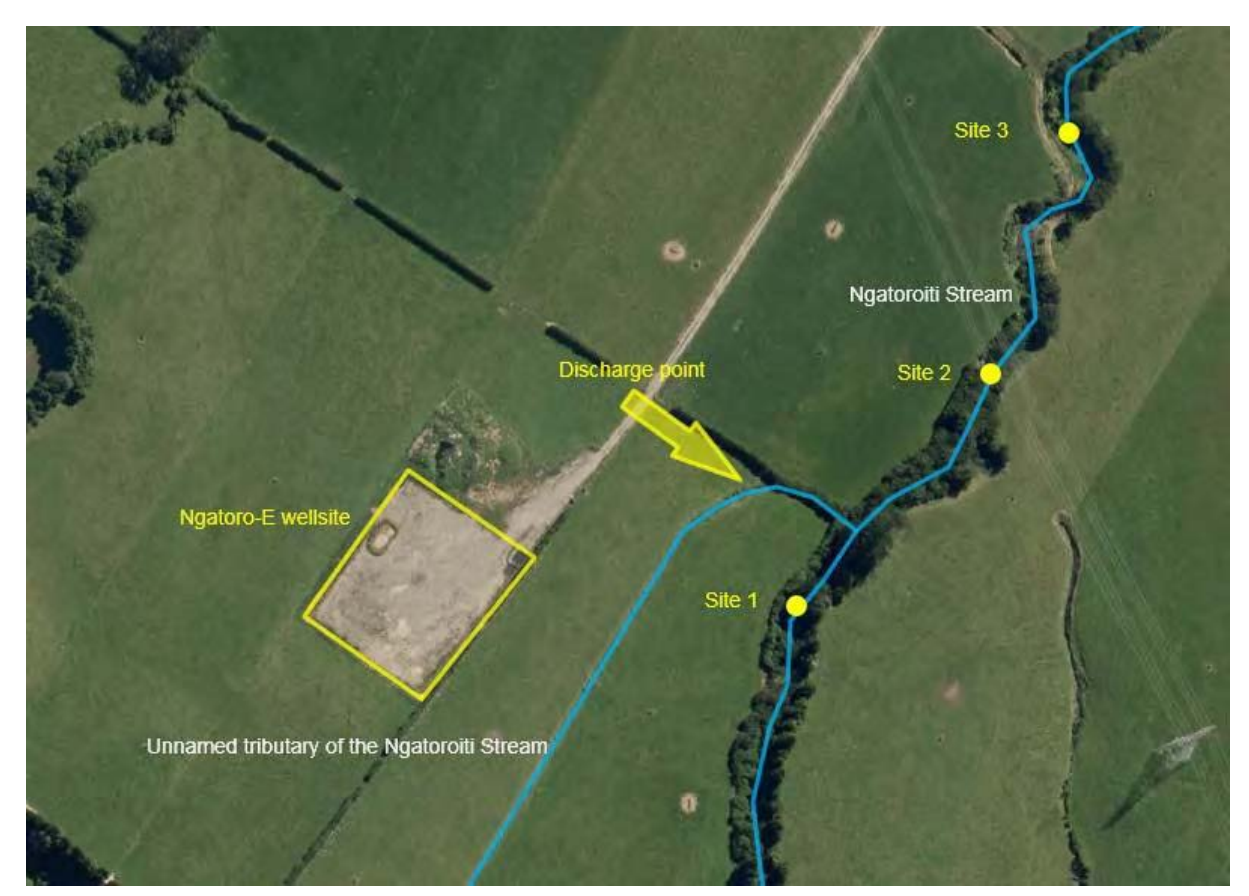
Figure 3 Biomonitoring sites in the Ngatoroiti Stream in relation to the Ngatoro-E wellsite