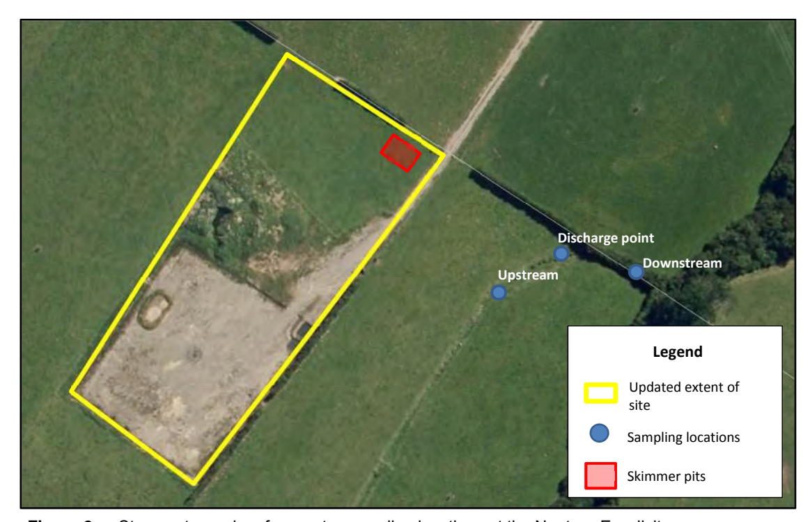
Figure 2 Stormwater and surface water sampling locations at the Ngatoro-E wellsite

The receiving surface water body was inspected regularly in conjunction with site inspections. No effects were observed and the stream appeared clear with no visual change in colour or clarity. In addition, no odour, oil, grease films, scum, foam or suspended solids were observed in the stream as a result of activities at the Ngatoro-E wellsite during the monitoring period.