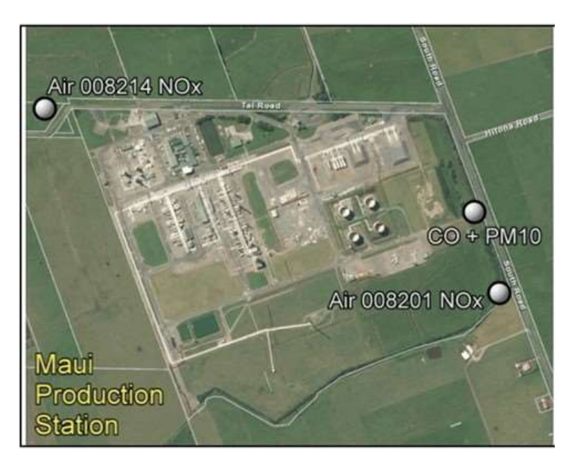
Figure 3 Air monitoring sites at Maui Production Station