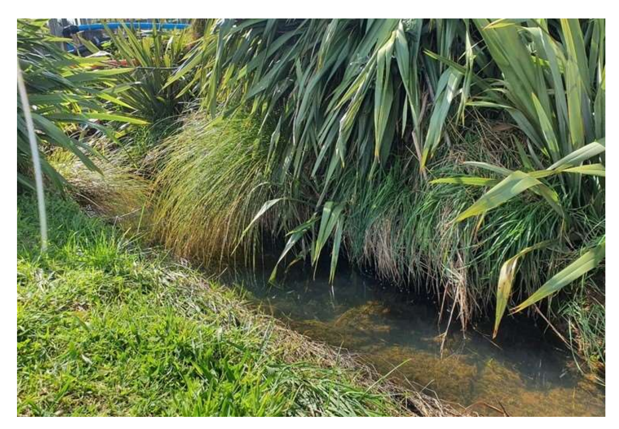
Photo 2 Combined discharge in the drain/tributary prior to entry into the Ngapirau Stream

Chemical water quality sampling of the treated stormwater discharge from the production station was undertaken once during the 2023/24 period. The location of the sampling site (IND002015) is shown in Figure 1. Table 2 presents the results of this sampling.