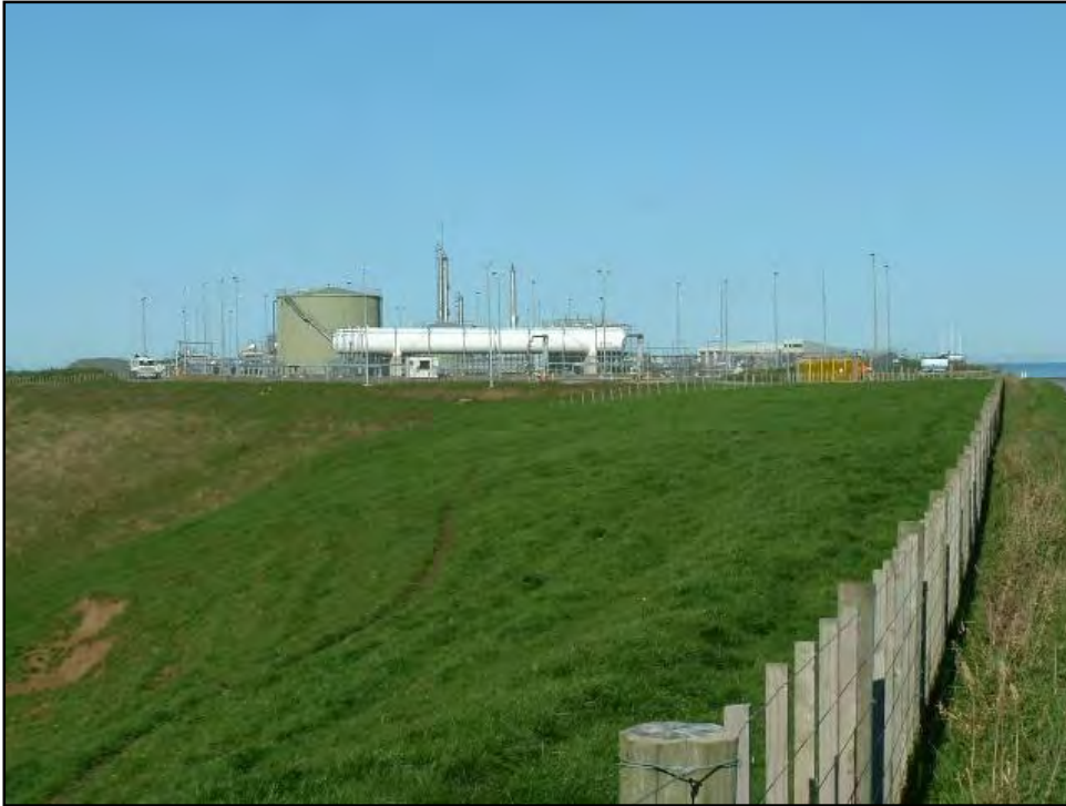
Photo 1 Rimu Production Station