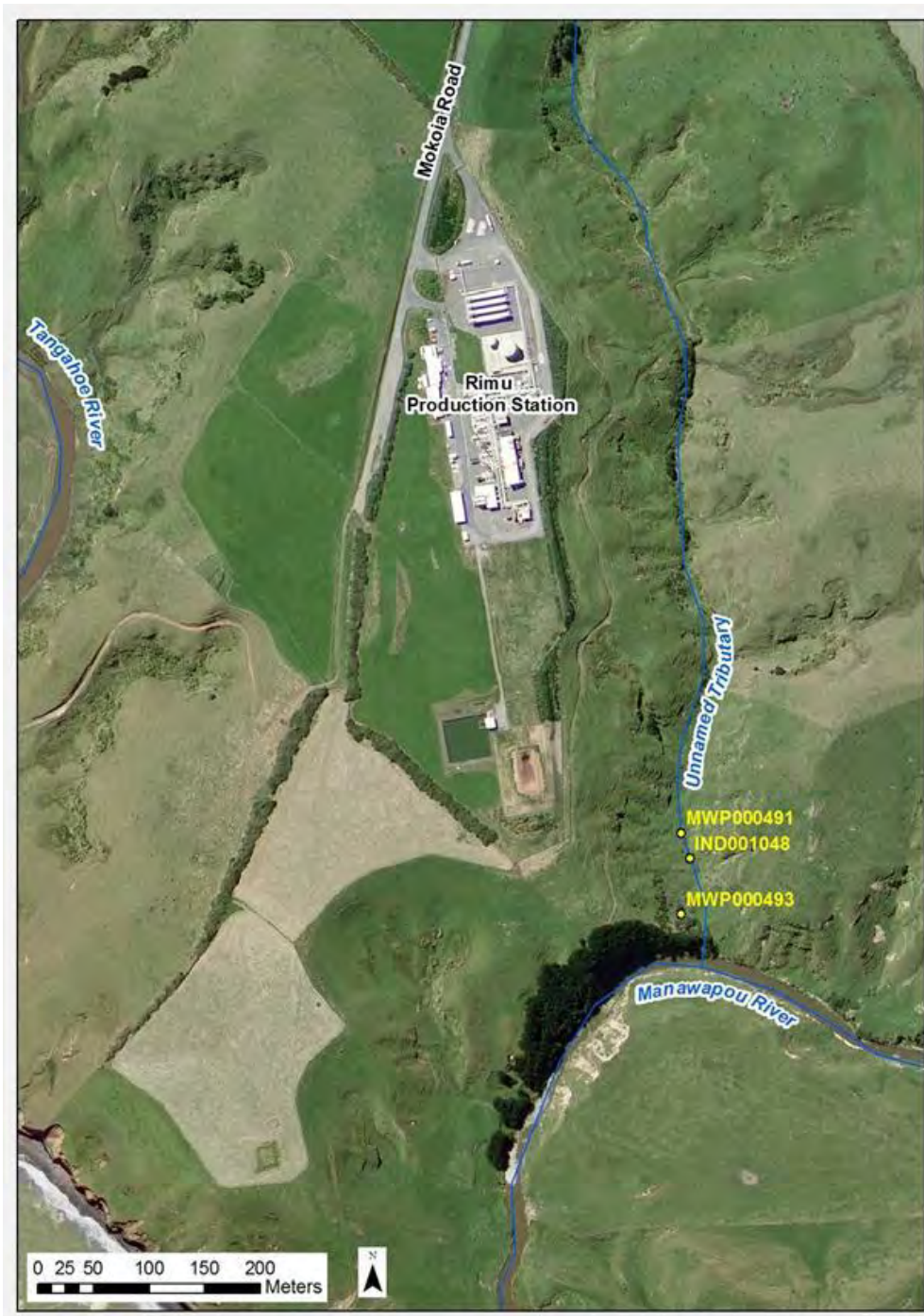
Figure 1 Location of the Rimu Production Station and associated sampling sites

The production station discharge was sampled on one occasion, and the sample analysed for chloride, hydrocarbons, conductivity, pH and suspended solids. The unnamed tributary of the Manawapou River was sampled on one occasion, and the samples analysed for the same constituents.