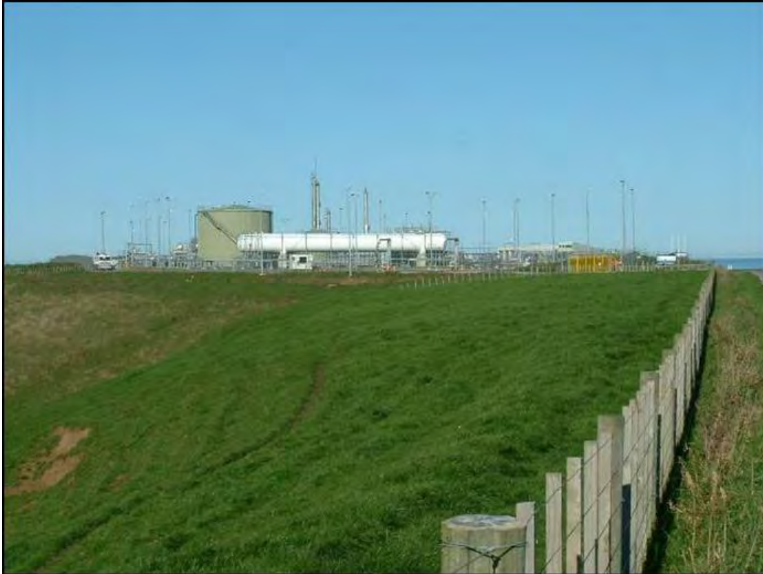
Photo 1 Rimu Production Station

The production station and associated wellsites were divested to Westside New Zealand Limited on 1 November 2016.