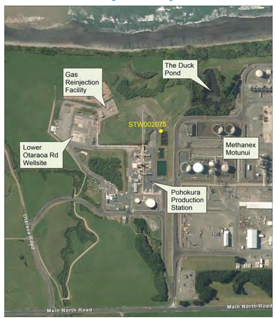
Figure 1 Pohokura onshore facilities and the combined discharge sampling site STW002075

Samples were collected of the combined discharge from the wellsite and production station at the wetland outlet (site STW002075, Figure 1) on four occasions during the monitoring year. Table 2 presents the results.