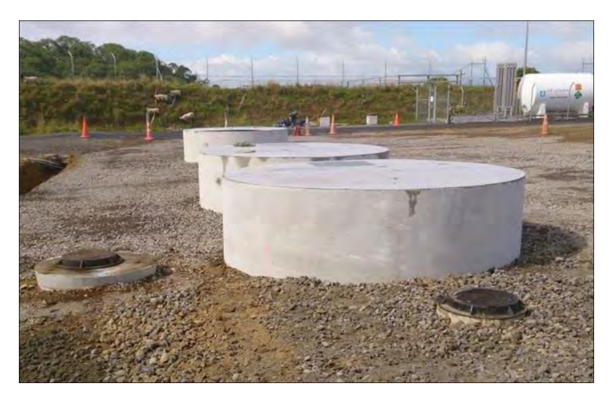
Photo 2 Upgraded stormwater system at the Lower Otaraoa Road wellsite