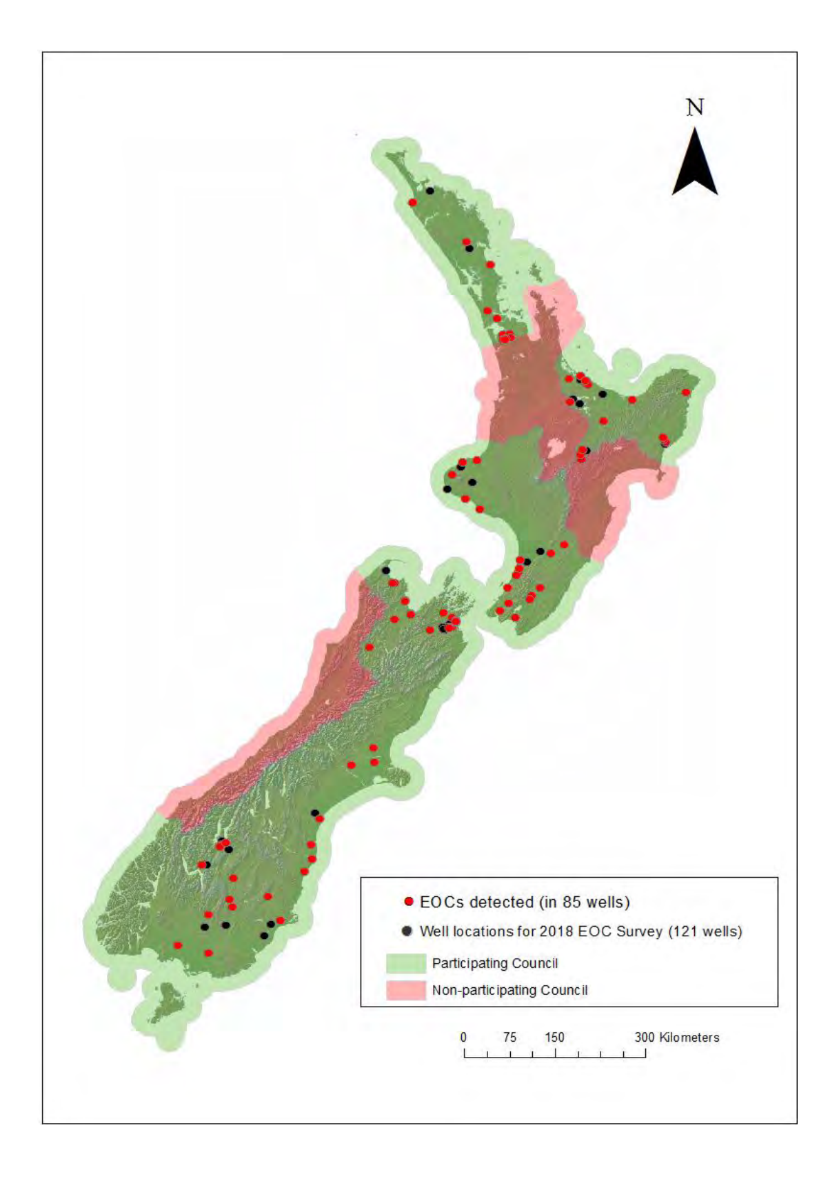
Figure 2: Regions and sampling locations for the 2018 survey of EOCs in groundwater.