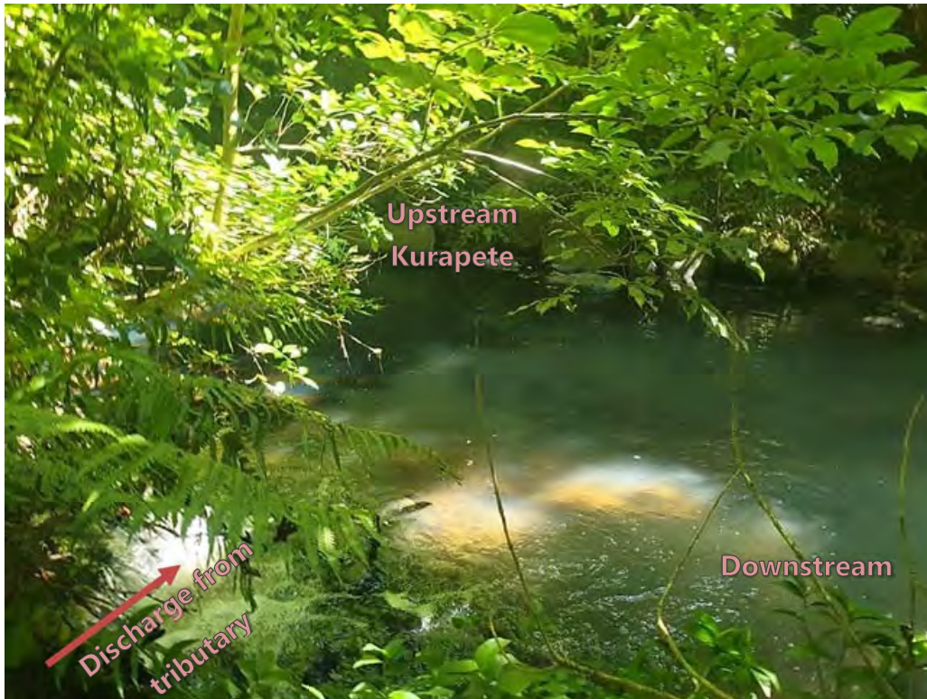
Photo 2 Confluence of the unnamed tributary and Kurapete Stream, 13 March 2020.