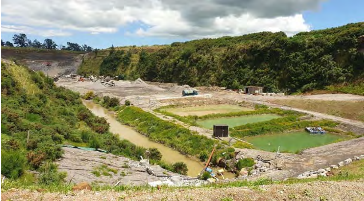
Photo 1 Everett Road Quarry view from upper pond area, looking at washwater treatment ponds and active excavation area, December 2019.

Stream, upstream of the Everett Road Bridge. Gravel filtered surface runoff from the entrance to the quarry, off Everett Road, and the upstream farm drainage enter the northern boundary drain, which also discharges into the unnamed tributary.