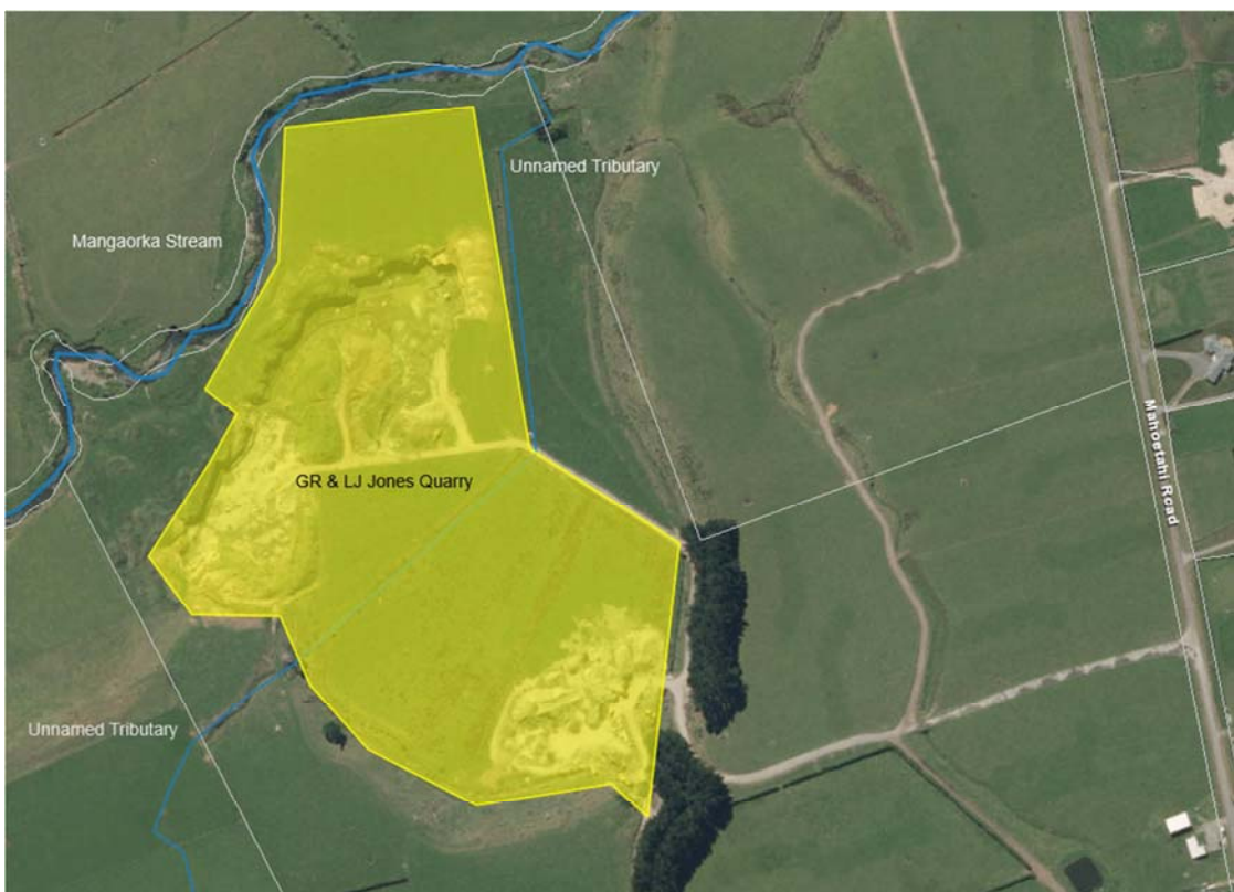
Figure 1 GR & LJ Jones quarry site

The processing site is set up to direct the stormwater away from the unnamed tributary of the Mangaoraka Stream. The stormwater around the crusher is directed to two settling ponds, which in turn discharge to a network of drains that flow to the tributary. Stormwater from the area where stockpiling is taking place is directed to an adjoining paddock where it soaks away.