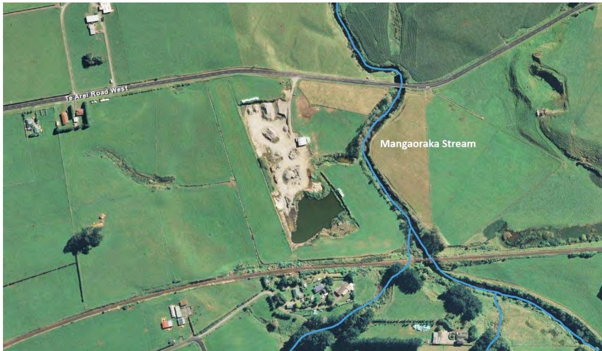
Figure 3 AA Contracting Limited Quarry site

Stormwater is collected in a series of drains which are interconnected with the settling pond; the point of discharge into the Mangaoraka Stream is approximately 120 m from the pond through a deep drain. Silt is collected in the drain prior to discharge through a controlled exit point into the stream. The site is contoured and bunded so that stormwater is directed away from the stream to the drain. From July to August 2006, the Company deepened and augmented an existing sediment pond to cater for their stormwater discharges; this pond now has enough capacity to not only capture and treat stormwater but also for dealing with washwater when necessary.