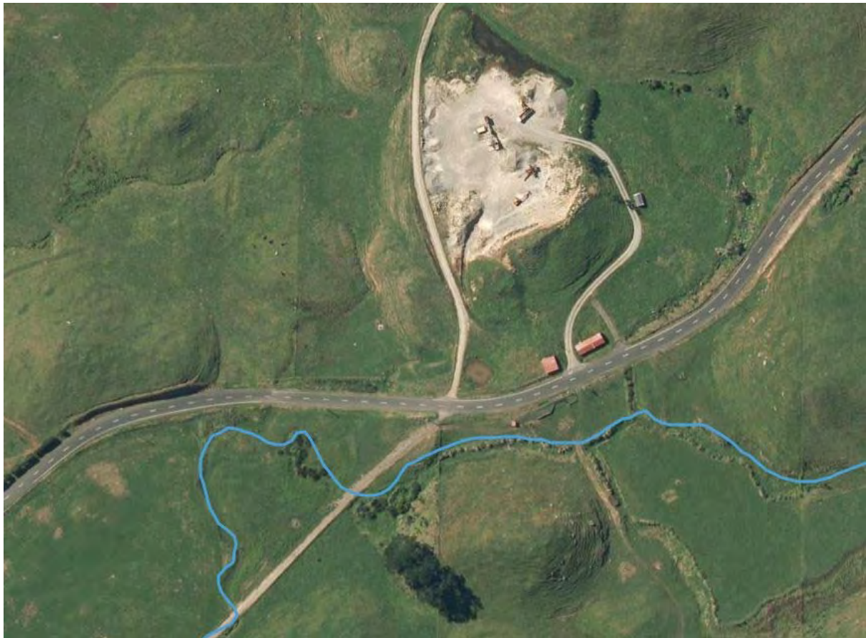
Figure 9 Goodin AG Limited quarry site

The Goodin AG Limited site at Kahui Road is located on the true right bank of an unnamed tributary of the Pungaereere Stream, in the Pungaereere catchment, located in Rahoitu (Figure 9). The quarry was operated as Surf Highway Excavations from 2005, and was transferred to Goodin AG Limited (the Company) on 19 December 2014. The quarry excavates between 4,000-6,000 m 3 /year with no washing or crushing performed at this site. The metal is screened and trucked away. The quarry site is situated between two unnamed tributaries of the Pungaereere Stream. One tributary is 300 m north of the site, the other is over 70 m south of the site on the other side of Kahui Road. The active quarrying area is approximately 1 ha and slopes to the northwest where stormwater is directed into a pond to soak away.