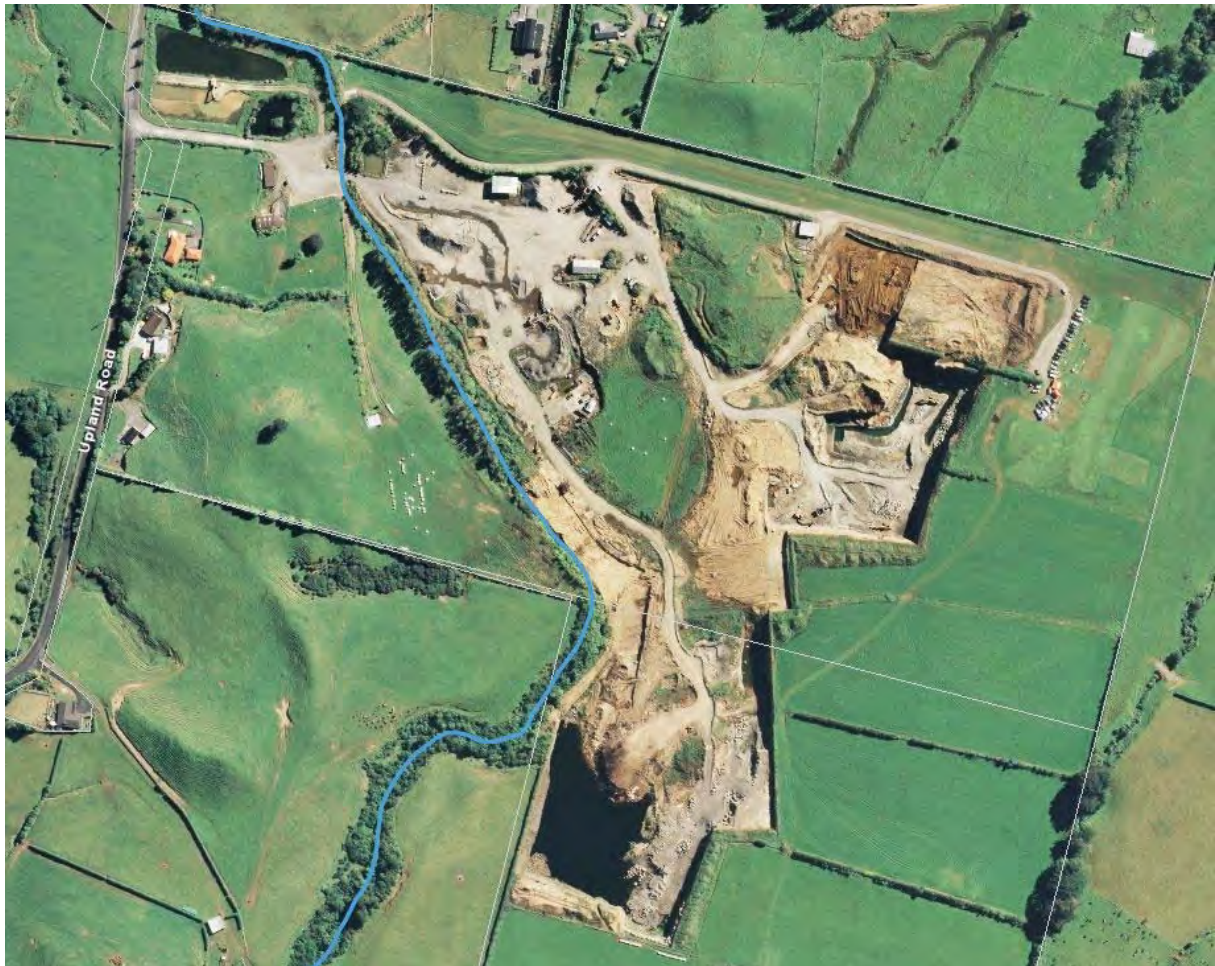
Figure 5 Ferndene Quarry site location map, showing unnamed tributary

This quarry began operating in 2004. At the extraction area, situated upstream of the Ferndene speedway, stormwater is collected at the bottom of the extraction pit. This is pumped from the pit to the first settling pond. Stormwater runoff also collects in a small pond at the entrance to the quarry, which is fed through a pipe to the first settling pond. The first settling pond feeds into the second settling pond, which is discharged through a weir to the unnamed tributary.