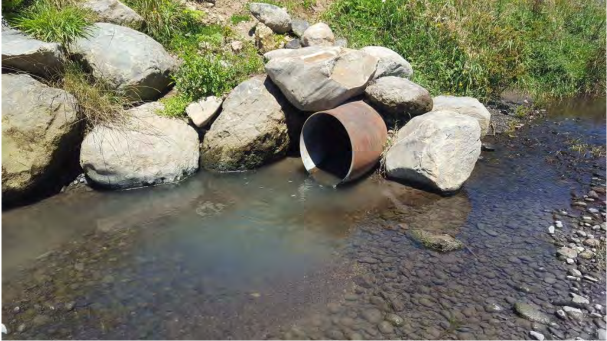
Photo 3 High sediment discharge from GR & LJ Jones Quarry, 28 January 2017