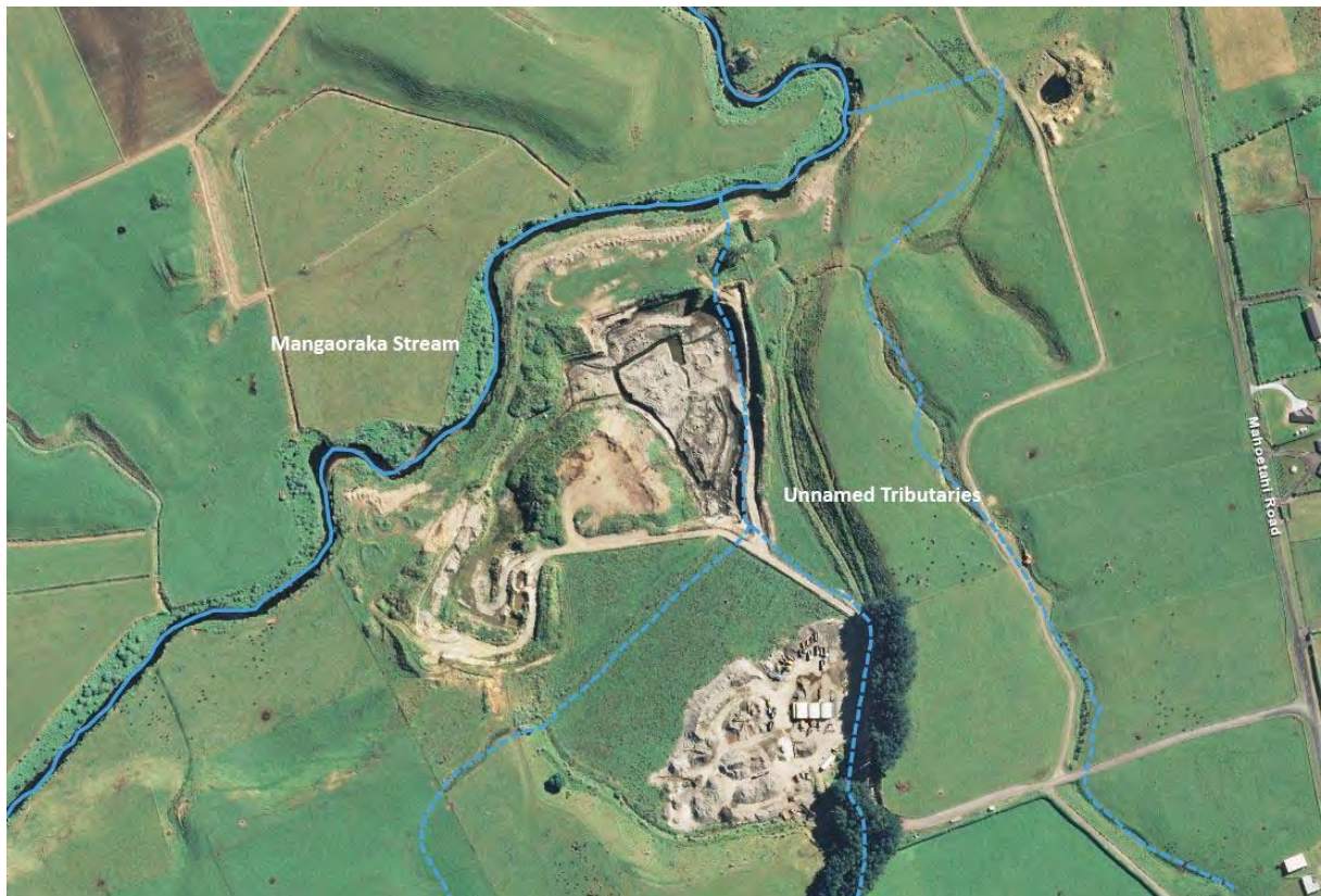
Figure 6 GR and LJ Jones Quarry site location map

Since the commencement of quarrying at the site, the consent holders have set up a processing area, separate from where the extraction is taking place. The processing site is set up to direct the stormwater away from the unnamed tributary of the Mangaoraka Stream. Stormwater from the settling pond in the extraction pit, and stormwater from the base of the cleanfill is pumped to a network of drains that flow to a final settling pond before discharge to the unnamed tributary.