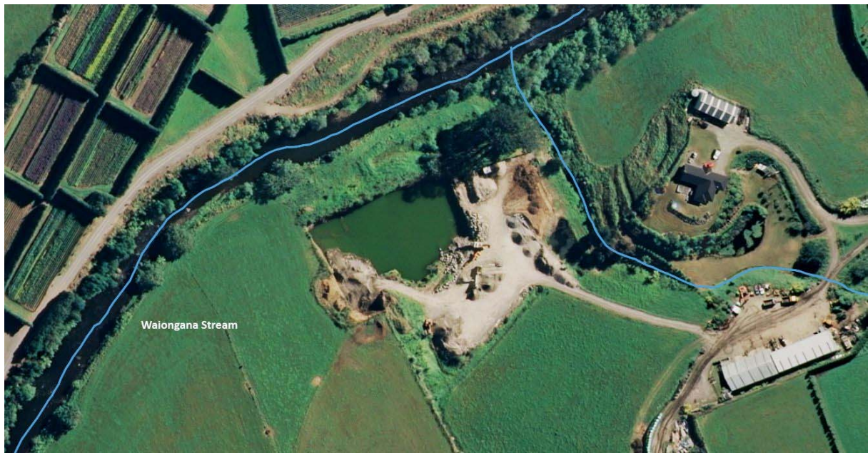
Figure 12 R J Dreaver Quarry and Landfill site

On-site stormwater is directed to a central collection area. This is then pumped to a series of three settlement ponds. An outlet control on the last pond regulates flow to the tributary, which flows into the Waiongana Stream. Aggregate washing does not take place on-site and crushing only occurs when sand is required for a particular job (a crusher is brought on-site for this purpose).