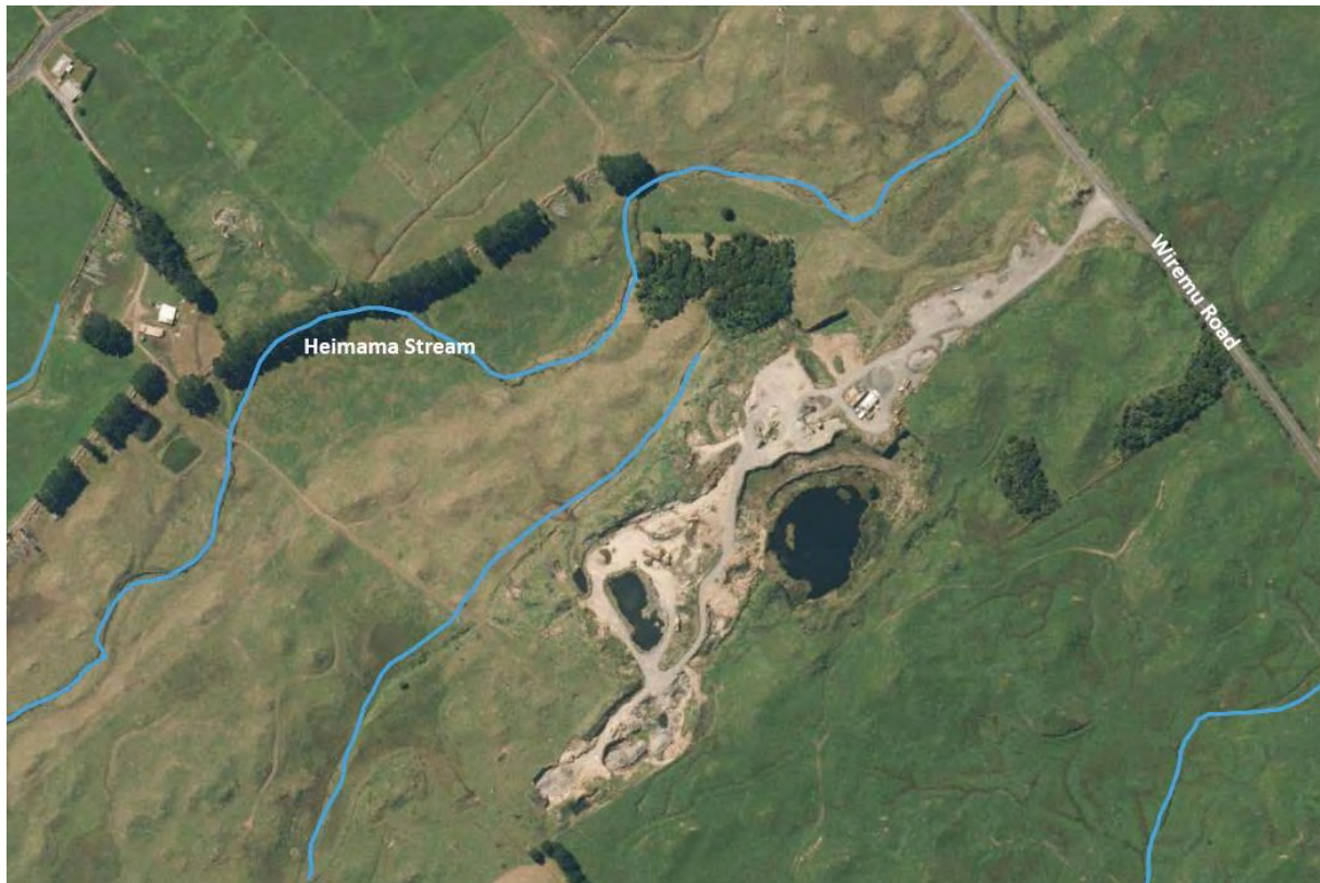
Figure 13 Taranaki Trucking Limited quarry site

Aggregate is excavated from volcanic debris flow material and washing is carried out on site. Processing washwater and site stormwater are directed through a network of open drains to the settling ponds. A washwater recirculation system is in place to maximise the efficiency of water use and minimise the volume of treated washwater discharged from the ponds into the unnamed tributary of the Heimama Stream. Discharge from the final treatment pond only occurs periodically.