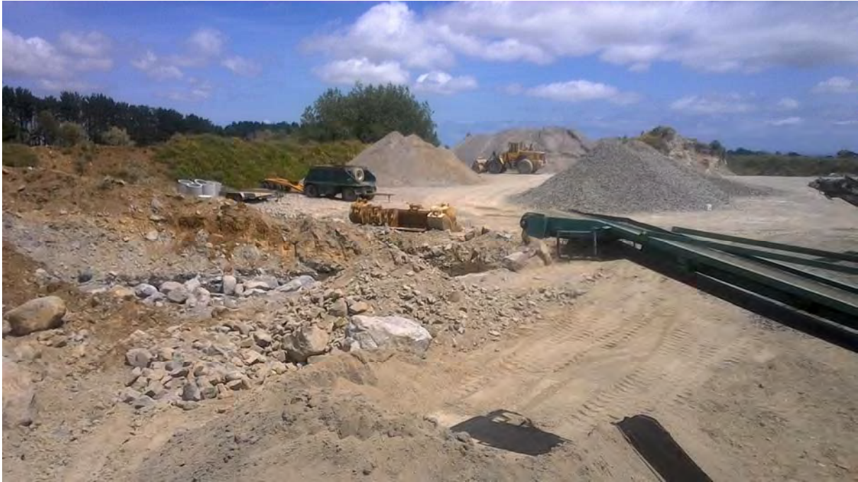
Photo 6 Puniho Road quarry site showing processing equipment and stockpiles

Three inspections were undertaken at the consent holder's Puniho Road quarry during the 2017-2018 period. Inspections noted the site is well bunded and the site floor directs water to the sediment ponds, which are working well. The ponds were discharging on one occasion and it was mostly clear stormwater. Site was tidy and well managed and the consent holder was assessed as being compliant with all consent conditions during the scheduled inspections (Photo 6).