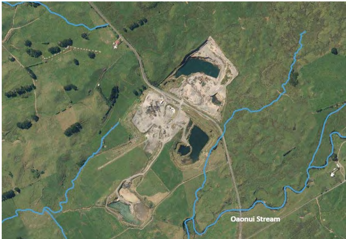
Figure 15 Wiremu Road Quarry Limited quarry site

The quarry site is bisected by Wiremu Road into two main areas, an upper and lower site. Bunding and contouring is used to isolate stormwater generated within the active sites from the surrounding land, and to direct stormwater and washwater to a large (former) excavation pit for recirculation. Recirculation minimises the volume of water abstracted for washing and discharge. Excess water is pumped from here to a series of settlement ponds before discharging to the unnamed tributary of the Manganui Stream.