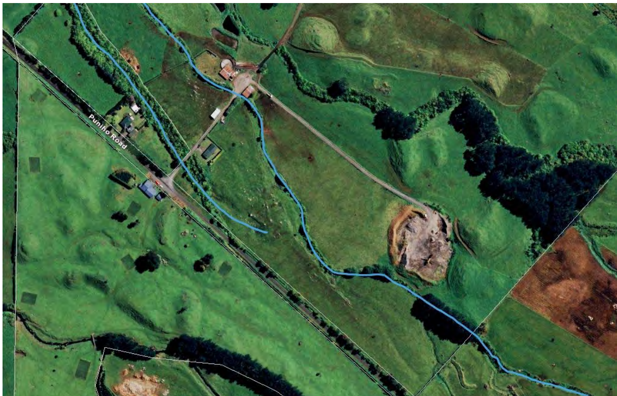
Figure 8 Gibson Family Trust Puniho Road quarry site

Gibson Family Trust (the consent holder) operates a quarry on Puniho Road on the true right bank of an unnamed tributary of the Matanehunehu Stream, in the Matanehunehu catchment (Figure 8). The quarry is used to provide aggregate to the property for on farm development, and surplus aggregate supplies the local market. The primary stormwater control measures are earth bunding around the perimeter of the site and large soakage trenches inside the perimeter bunds, which hold water until it soaks into the ground. There has been a new pond installed prior to current ponds to collect stormwater from current working area. The quarry floor is covered in a thick layer of coarse aggregate metal, and slotted drainage pipes have been placed within the quarry floor and around the rear perimeter to redirect surface runoff to a soakhole. A single drainage pipe directs flow to the unnamed tributary of the Matanehunehu Stream.