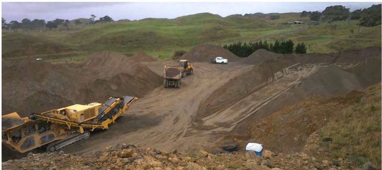
Photo 2 Kekeua Road quarry run by Jones Quarry Limited, February 2018