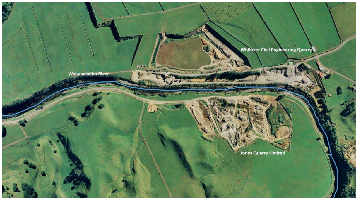
Figure 10 Jones Quarry and Cleanfill site

Jones Quarry Limited's Hydro Road quarry is located on the true left bank of the Waiwhakaiho River, in the Waiwhakaiho catchment, approximately 3.5 km south east of New Plymouth on Hydro Road (Figure 10). The consents to operate the quarry and cleanfill for this site were transferred to Jones Quarry Limited (the Company) on 10 February 2015; prior to this the quarry has been operated as Graham Harris (2000) Limited, and New Plymouth Quarries Limited. Active quarrying and exposed areas are contoured and bunded to direct stormwater to treatment ponds prior to discharge. Reinstatement of excavated areas at the quarry is carried out using cleanfill.