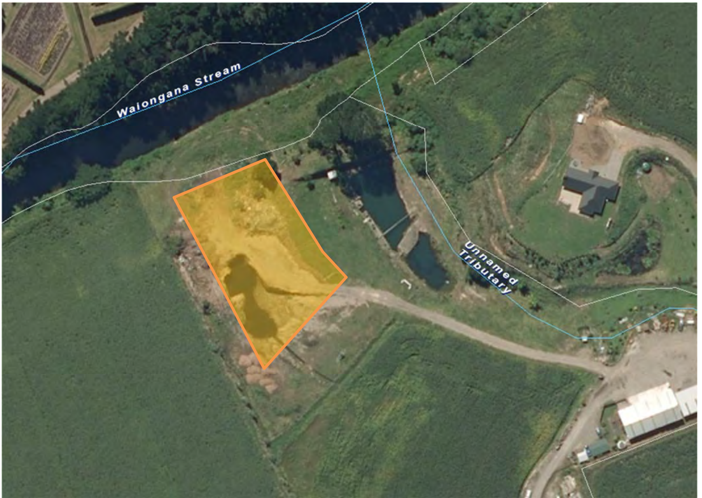
Area authorised for cleanfill