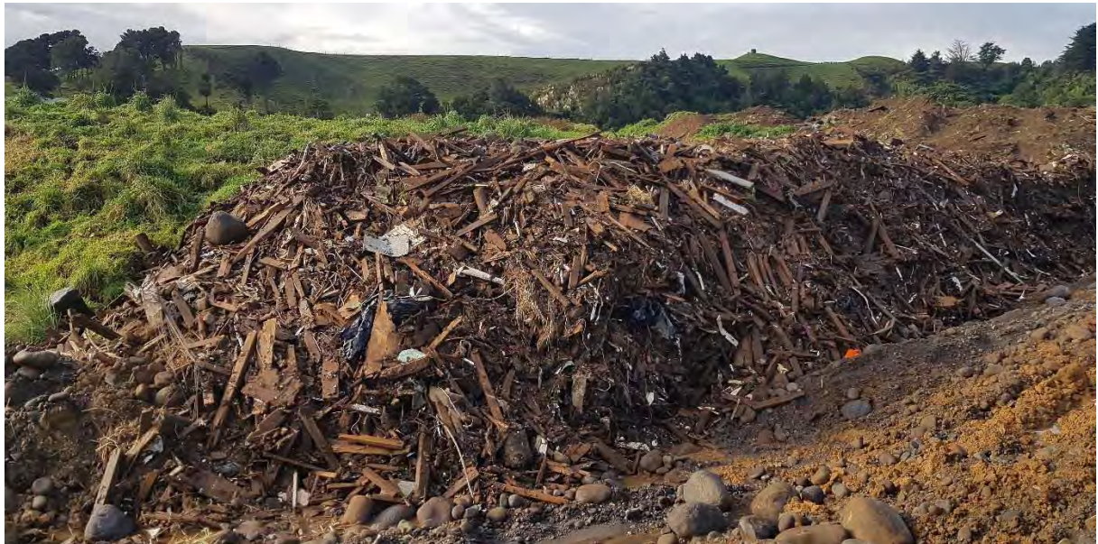
Photo 9 Tanalised Cleanfill material to be removed to comply with consent conditions