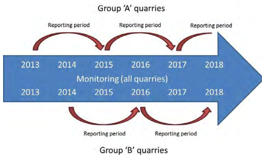
Figure 1 Previous reporting cycles for combined quarry groups 'A' and 'B'

This report is the third combined biennial report by the Taranaki Regional Council (the Council) for the quarry monitoring programmes in the region. In the past there have been two biennial streams in which quarry monitoring programmes are reported (Figure 1). It was decided in the 2015-2017 combined quarry report that the grouping of quarries into groups A and B for reporting purposes be discontinued. Quarries in Taranaki are now managed and reported on in two groups, Northern quarries and Southern quarries, based on their physical location (Figure 2). All quarries are reported on biennially.