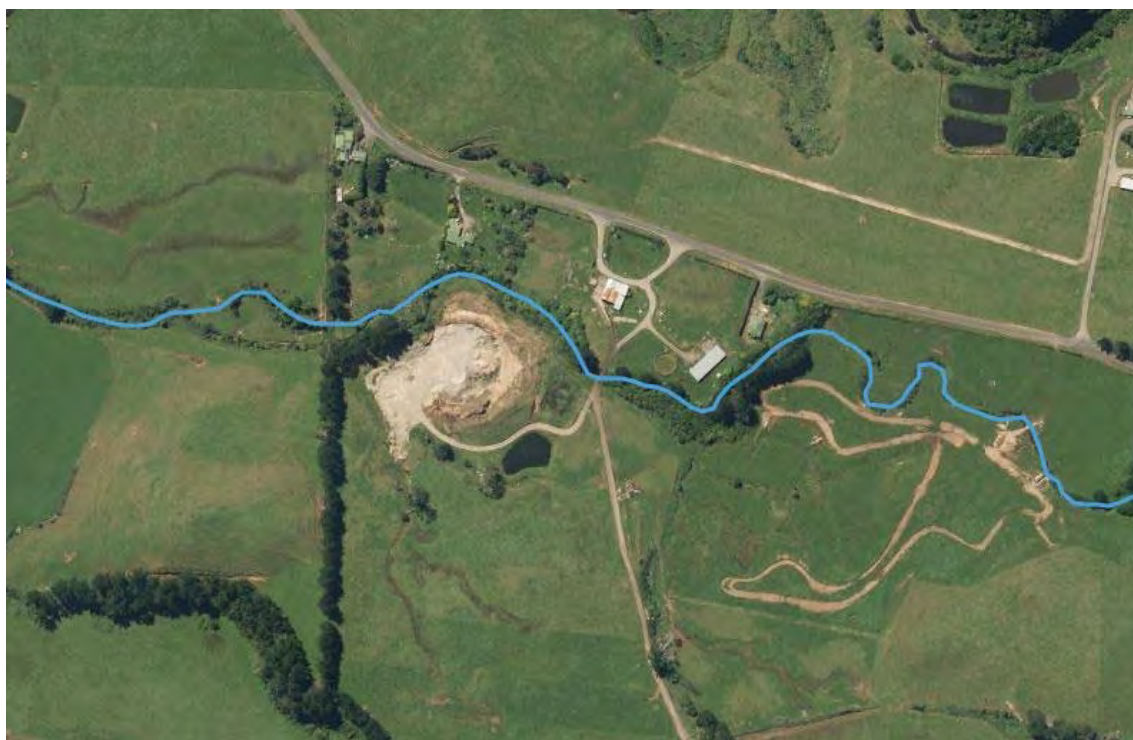
Figure 7 Gibson Family Trust Newall Road Quarry site

The Gibson Family Trust site at Newall Road is located on the true left bank of an unnamed tributary of the Teikaparua River, in the Teikaparua (Warea) catchment (Figure 7). The quarry was operated as Brian Crawford Contracting Limited from 2004, and was transferred to Gibson Family Trust (the consent holder) on 23 April 2015. The consent holder's quarry supplies aggregate to a mostly local market. No washing is performed on site and machinery is brought on site as required. The active quarry area is bunded and ring-drained to direct stormwater to the two stage settling pond system. Treated stormwater is discharged into the unnamed tributary through the overflow channel from pond 2.