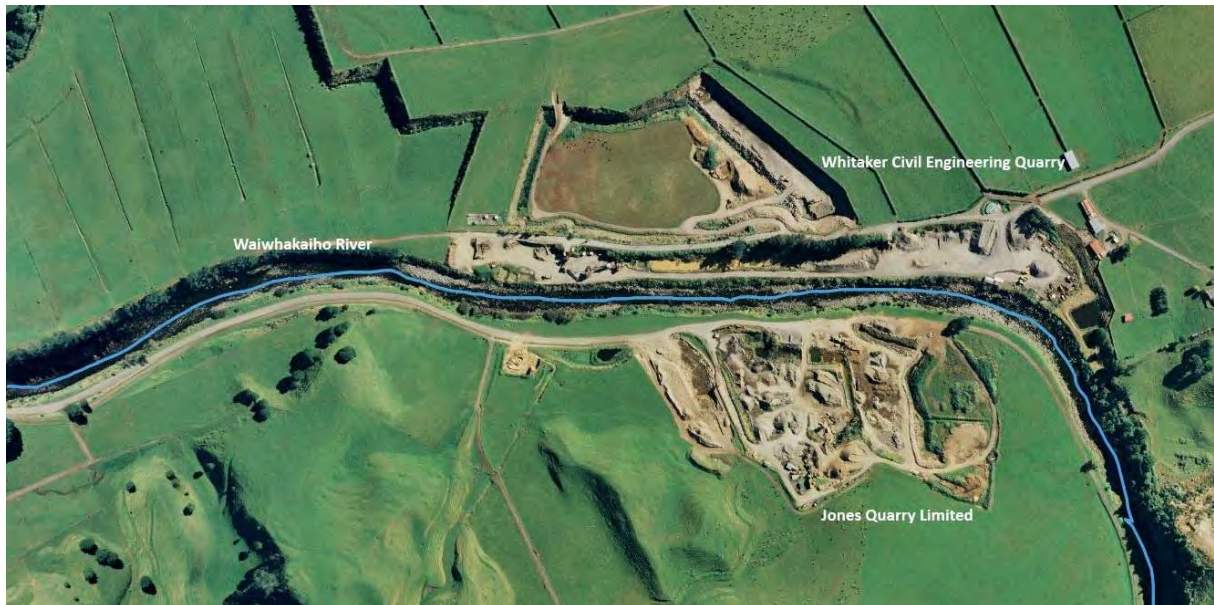
Figure 14 Whitaker Civil Engineering Limited Quarry site

The quarry has washing facilities as well as a dry crusher, screens and excavators onsite. The active quarrying area is approximately 1.5 ha. Exposed earth areas in the main site are contoured and banded to direct surface runoff to two soak holes. The clean fill site and surrounding area is contoured to runoff to a ring drain, which discharges to the Waiwhakaiho River. The washwater system is circulatory and goes through a 2 pond settlement pond system before being reused. Reinstatement of excavated areas is carried out using cleanfill.