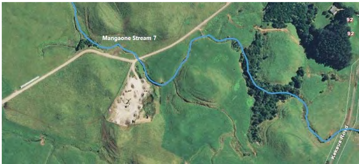
Figure 4 Map of Coastal Drainage/Jones Quarry Kekeua Road quarry, showing Mangaone Stream 7.

Kekeua Road quarry is located on the true right bank of the Mangaone Stream 7, off Kekeua Road, Warea (Figure 4, Photo 2). The quarry was granted a consent in 2009 but was not included on a monitoring programme until 2017, and had such been in breach of special conditions regarding the allowed size of the active quarry area. The consent was granted under Coastal Drainage Limited (the Company) but the quarry has been managed by Jones Quarry Limited in recent years. The Company have since surrendered their consent and Jones Quarry Limited are in the process of applying for a new consent for the now extended quarry. Stormwater for the site is currently being drained to a soak hole, with no active discharge to the nearby Mangaone Stream 7.