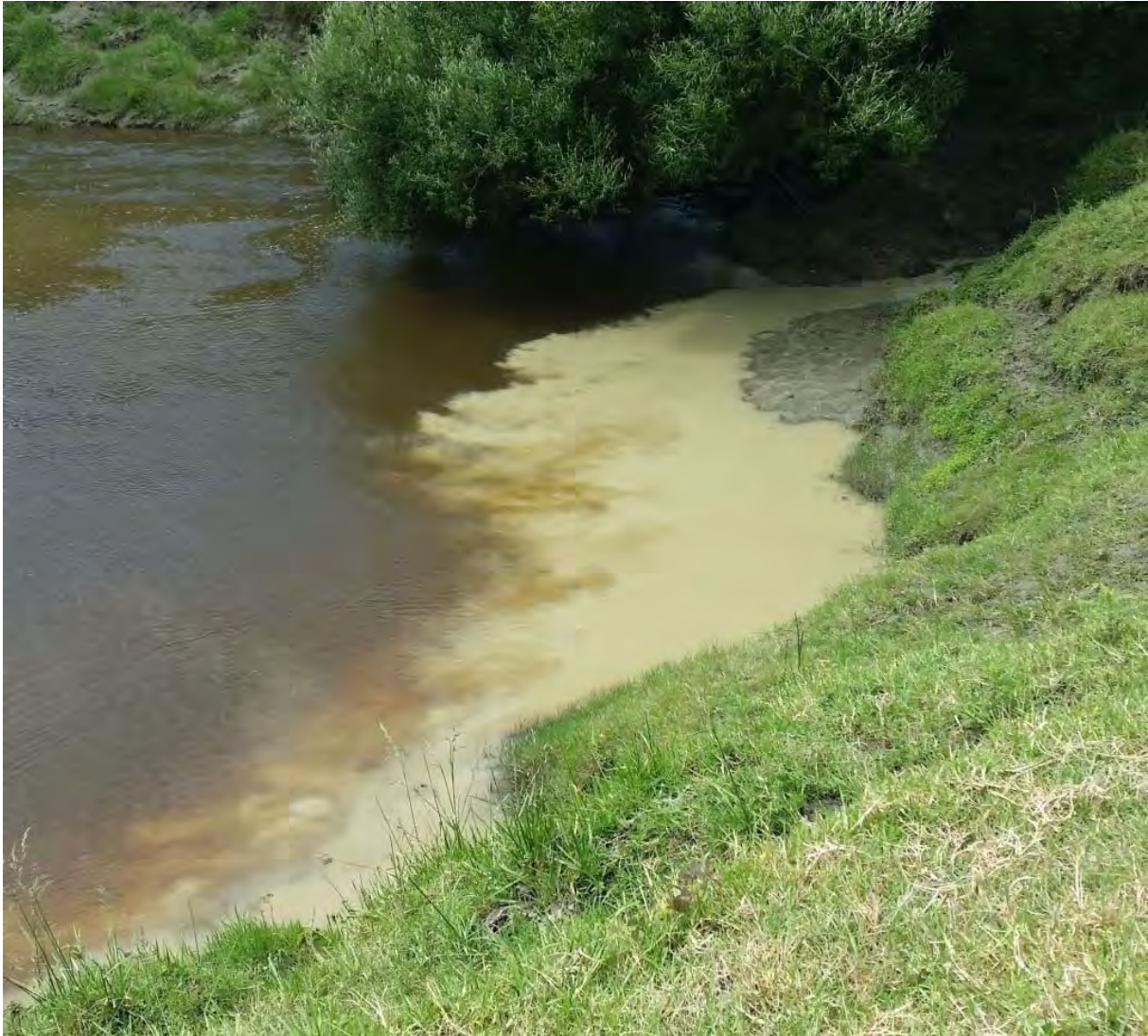
Photo 10 Jones Quarry Uruti Stone Limited's (Valley Mineral's at the time) contaminated water discharge flowing into the Mimi River, 14 December 2016.

The following inspection showed compliance with consent conditions and discussions were had around upgrading retention ponds and maintenance to be undertaken on the dam. The final inspection before Jones Quarry took ownership, showed deterioration of the site due to inactivity. Non-compliance was given due to erosion onsite resulting in discharge of contaminants, which may enter the unnamed tributary, as well as lack of reinstatement of quarried areas.