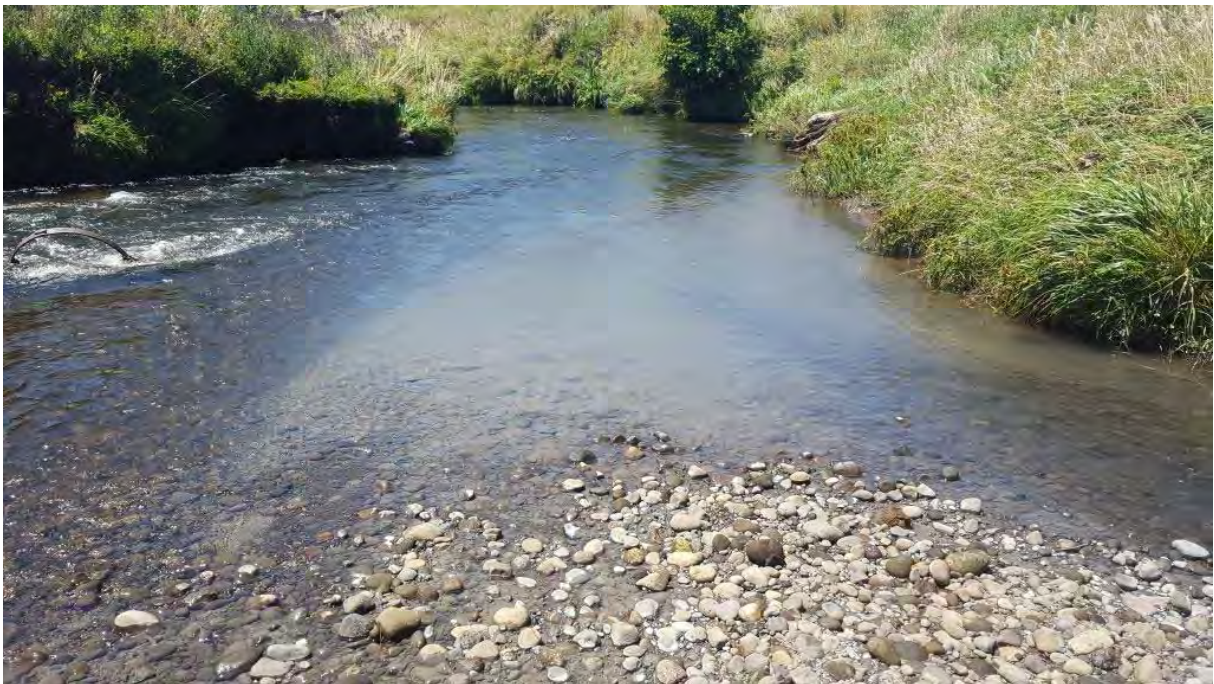
Photo 4 Sediment laden discharge plume moving downstream, 28 January 2017

The Council monitors for possible effects on stream life by conducting a visual inspection of the discharge from the quarry and streambed both up and downstream of the quarry discharge point. Inspections of the site over the 2016-2018 monitoring period noted one instance of adverse effects occurring in the receiving water, due to high suspended solids reducing visual clarity.