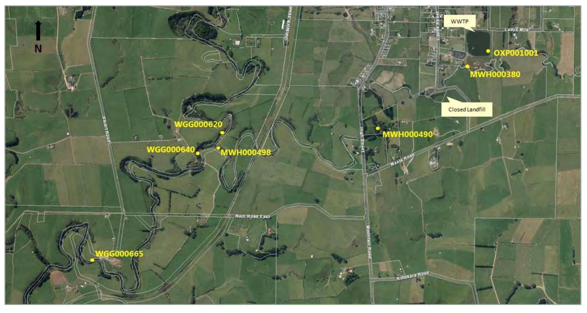
Figure 3 Aerial map showing location of chemical and biomonitoring sampling sites