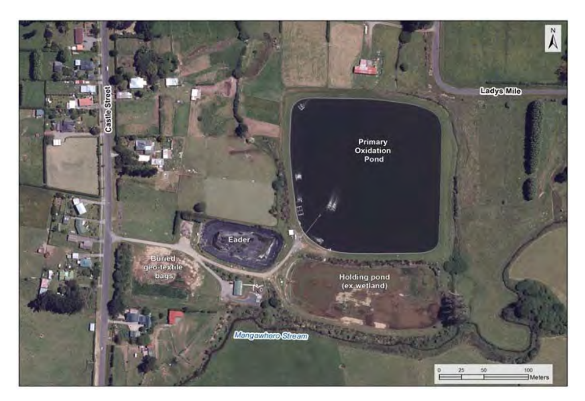
Figure 2 Aerial view of the Eltham WWTP

Work commenced on the pipeline connection to the Hawera WWTP during the latter half of the 2008-2009 monitoring period. A step screen and new inlet to the primary pond were constructed on the raw wastewater reticulation and a new stormwater pipe from this area was directed to the wetland. The wetland was converted to a holding pond in early 2011 to provide high stormwater ingress containment in excess of the pumping capacity of the new pipeline connection. This system is anticipated to have an overflow frequency of one to two occasions in any five year period necessitating a new consent for this discharge which was granted in November, 2009 (consent 7521). Monitoring of overflows from the pond is provided and incorporated within the consent holder's telemetry system.