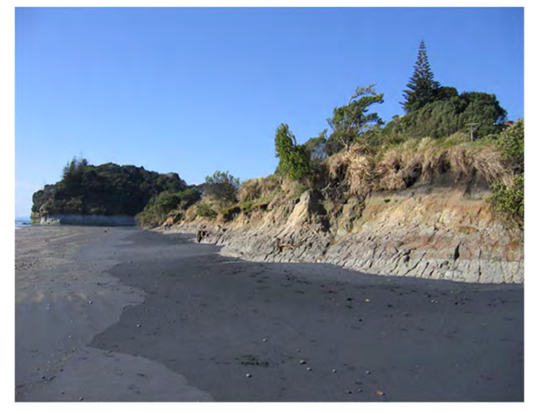
Photo 3 Erosion on Wai-iti foreshore prior to construction of the rock wall

Over the summer and autumn months of 2004, rough seas combined with high tides reached the beach toe of the coastal banks and sand dunes that front the Retreat. Fresh erosion scarps were cut into these banks for nearly the full beach frontage, where no system of protection existed (Photo 3).