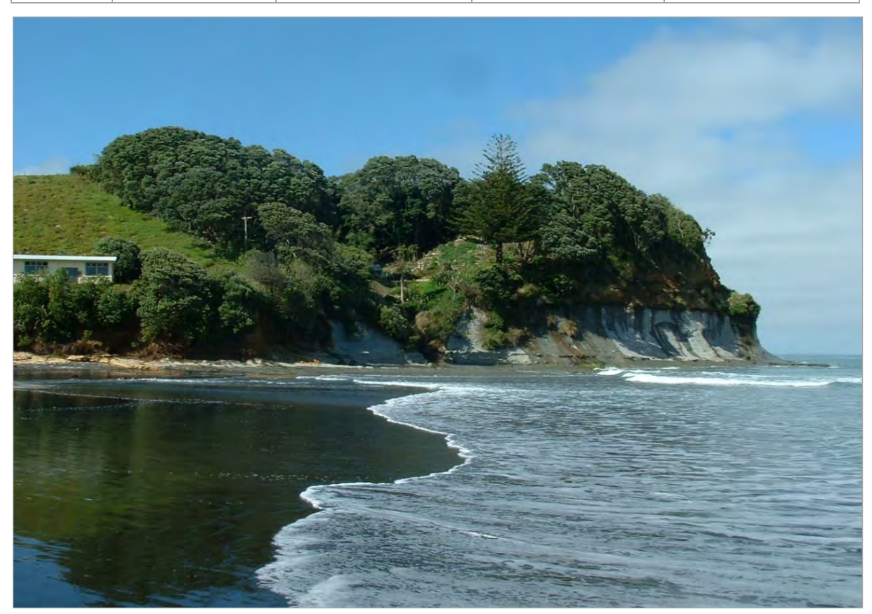
Photo 4 Coastal Site 4 at Wai-iti Beach, looking towards Site 5, with the Wai-iti Stream entering from center-left