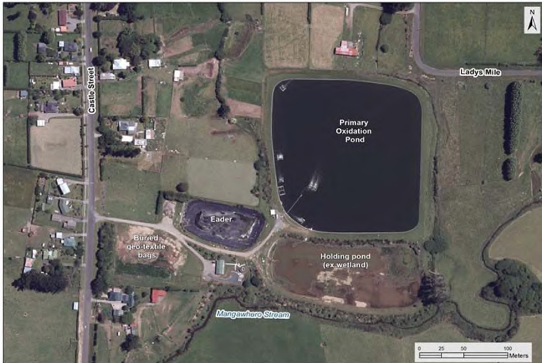
Figure 2 Aerial view of the Eltham WWTW

Work commenced on the pipeline connection to the Hawera WWTW during the latter half of the 2008-2009 monitoring period. A step screen and new inlet to the primary pond were constructed on the raw wastewater reticulation and a new stormwater pipe from this area was directed to the wetland. The wetland was converted to a holding pond in early 2011 to provide high stormwater ingress containment in excess of the pumping capacity of the new pipeline connection. This system is anticipated to have an overflow frequency of one to two occasions in any five year period necessitating a new consent for this discharge which was granted in November, 2009 (consent 7521). Monitoring of overflows from the pond is provided and incorporated within the consent holder's telemetry system.