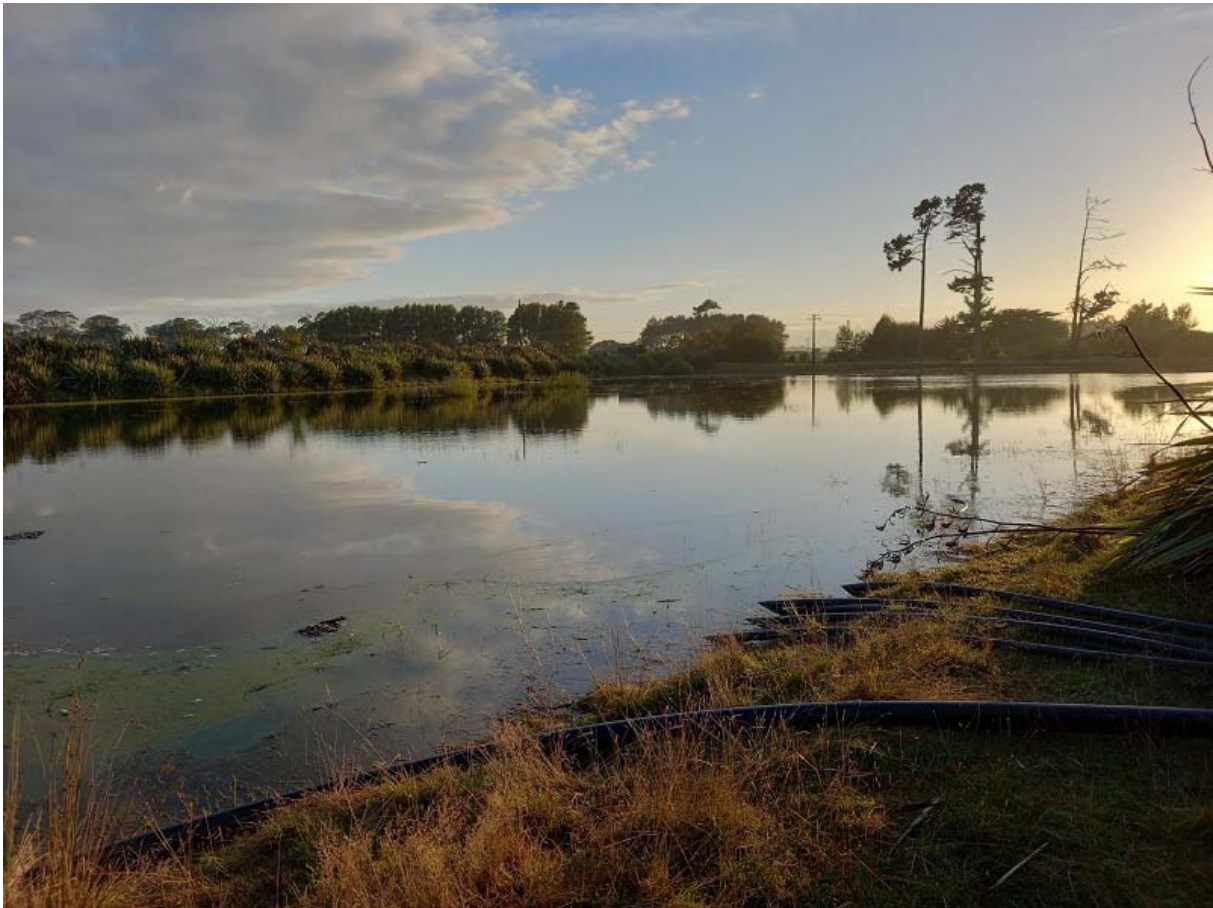
Photo 1 Overflow pipes from the holding pond to the unnamed tributary of the Mangawhero Stream, February 2022

The stream provided some dilution of the E. coli (from 8,660 MPN/100 ml in the discharge to 909 MPN /100 ml 400 m downstream), however numbers were still quite high prior to the confluence with the Waingongoro (1,789 MPN /100 ml). Levels in the Waingongoro upstream of the confluence (WGG000620) were elevated anyway (1,223 MPN /100 ml), dropping downstream of the confluence (860 MPN /100 ml).