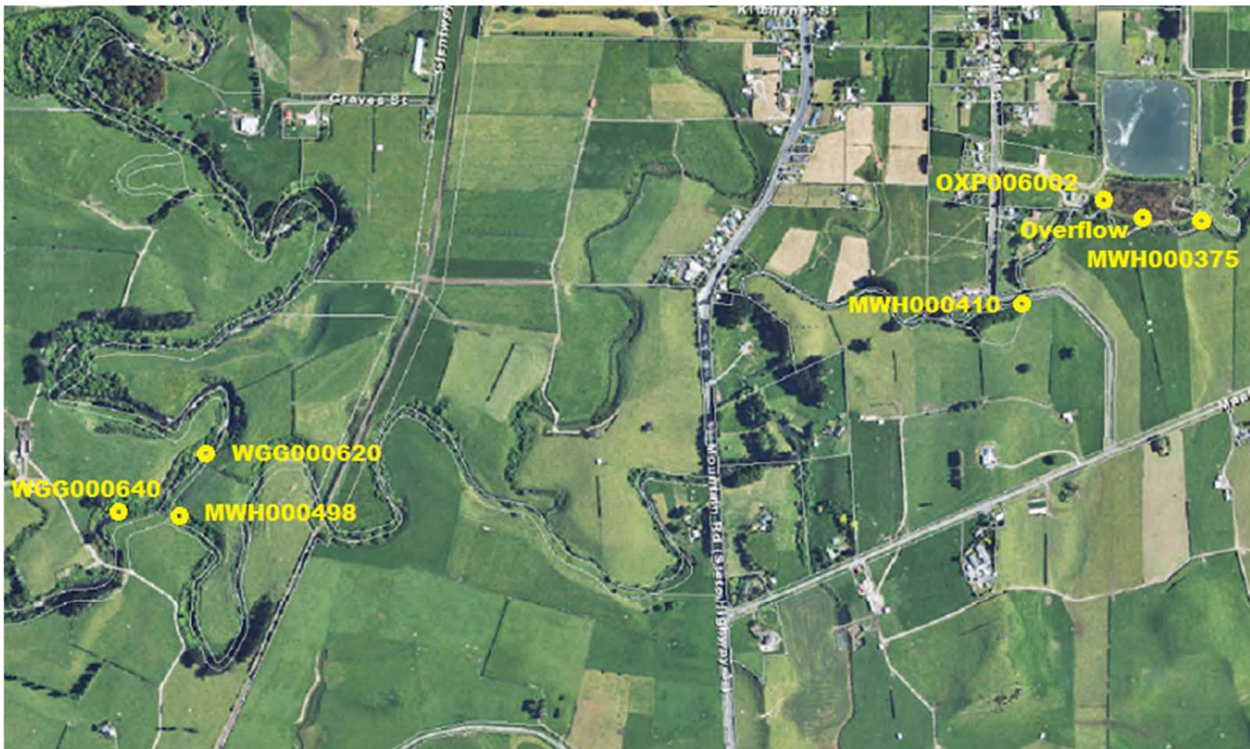
Figure 3 Aerial map showing location of sampling sites.