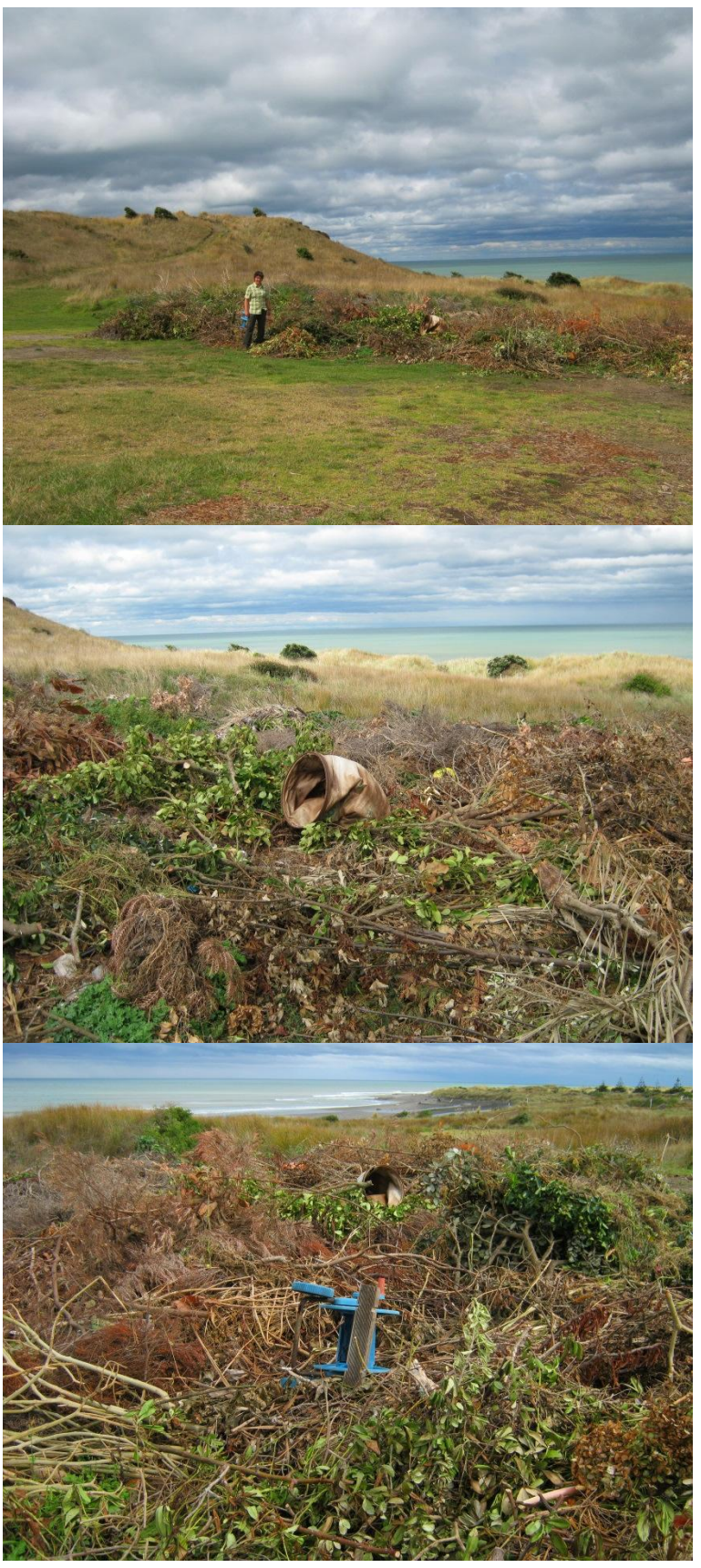
Photo 1 Green waste and domestic rubbish dumped at the Wai-inu Beach Camp 22 March 2012