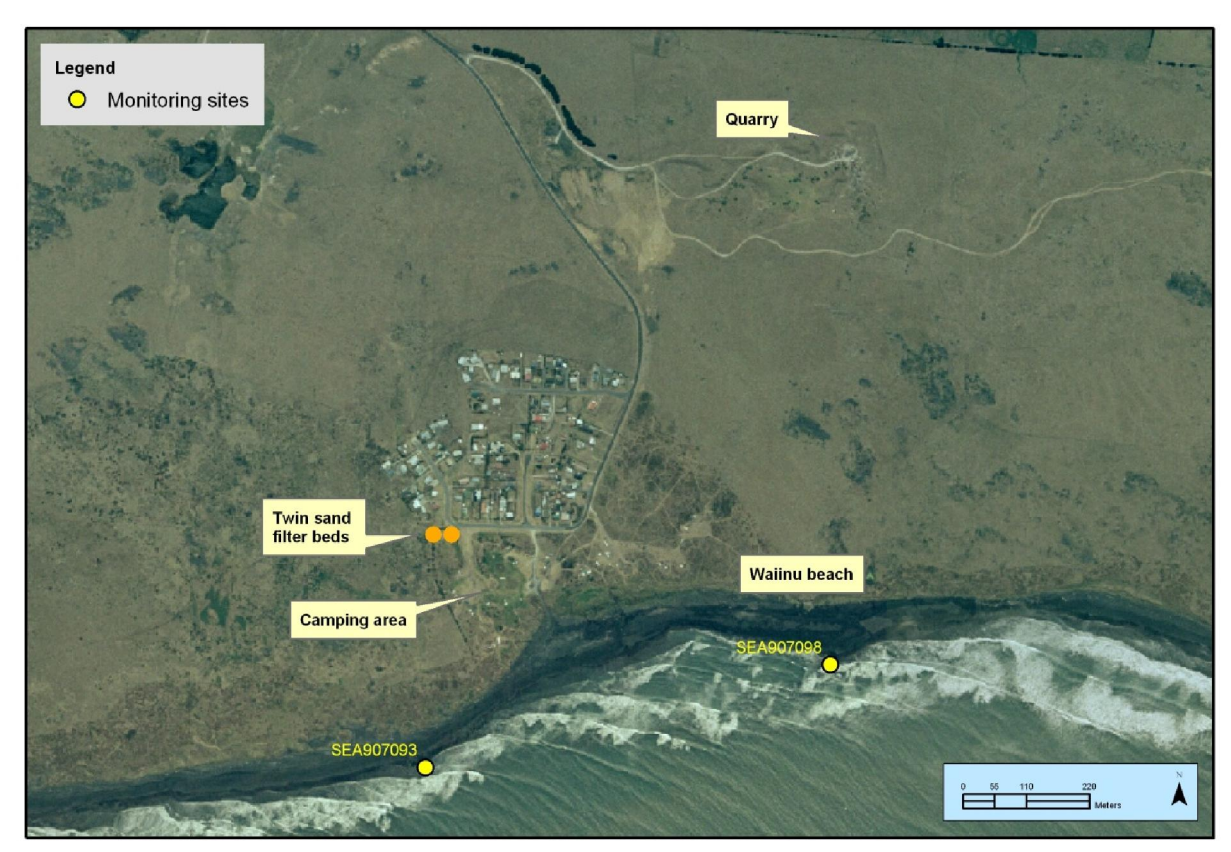
Figure 1 Location of bacteriological sampling sites and treatment system