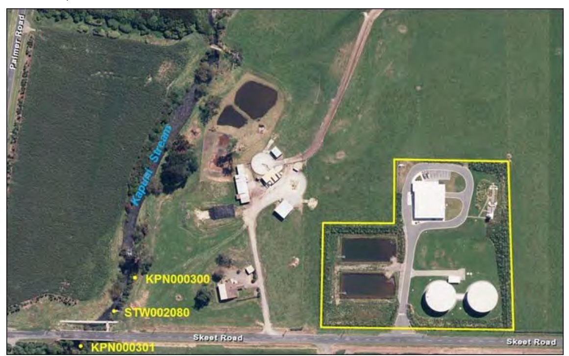
Figure 3 Aerial photo showing locations of the Kapuni WTP, and relevant sampling sites

Discharge and receiving water samples were taken at the Kapuni WTP (Figure 3) on two occasions and the results are presented in Tables 2 and 3.