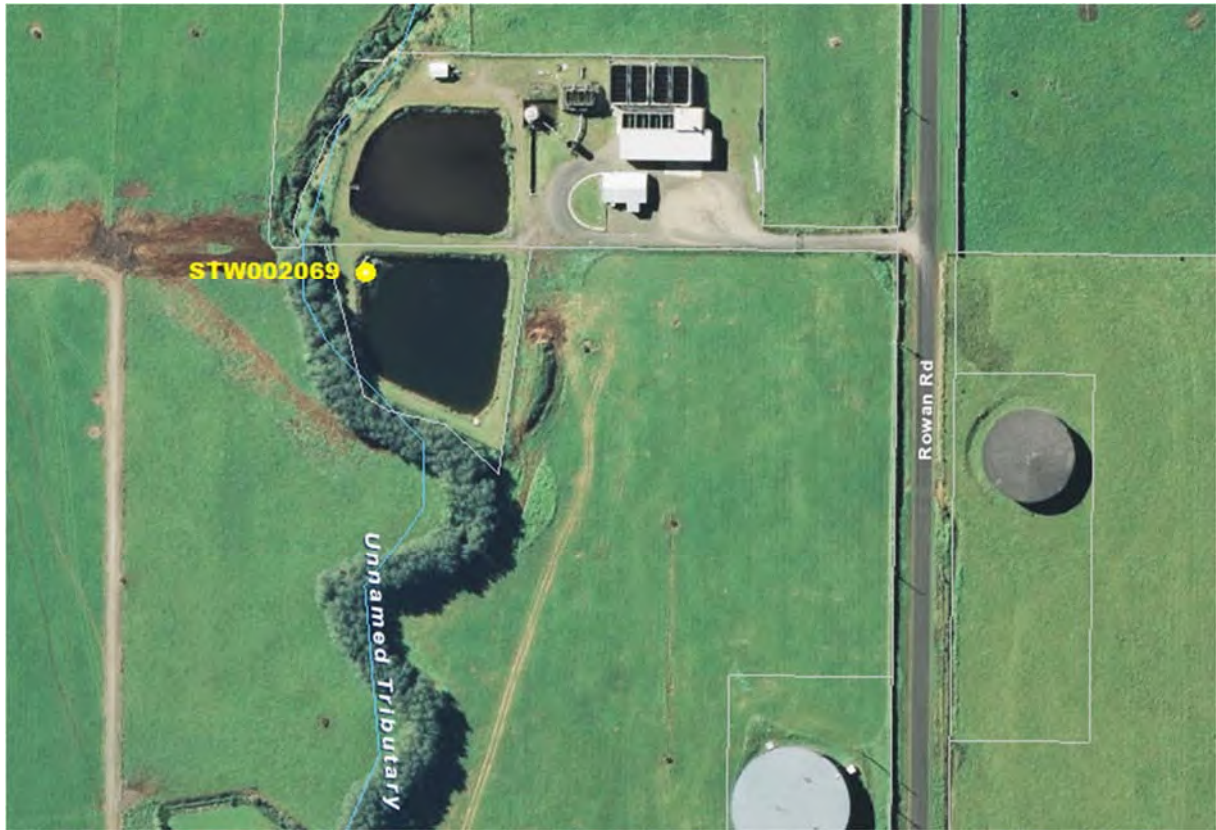
Figure 5 Aerial photo showing filter backwash sampling site STW002069 at Waimate West WTP