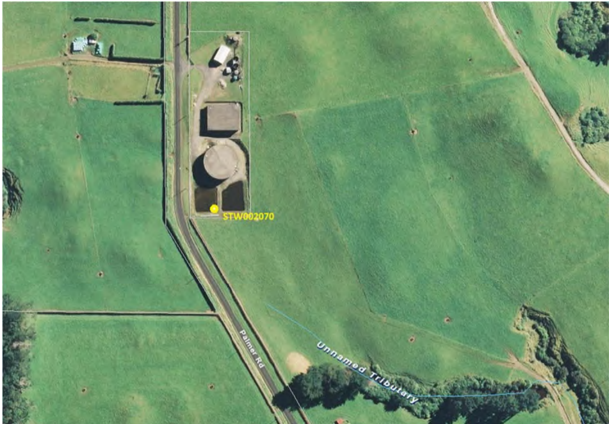
Figure 4 Aerial photo showing filter backwash sampling site STW002070 at Inaha WTP