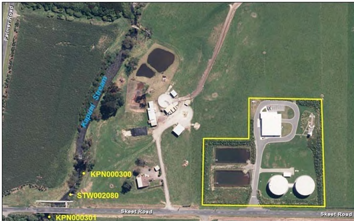
Figure 3 Aerial photo showing locations of the Kapuni WTP, and relevant sampling sites

Discharge and receiving water samples were taken at the Kapuni WTP (Figure 3) on two occasions and the results are presented in Tables 2 and 3.