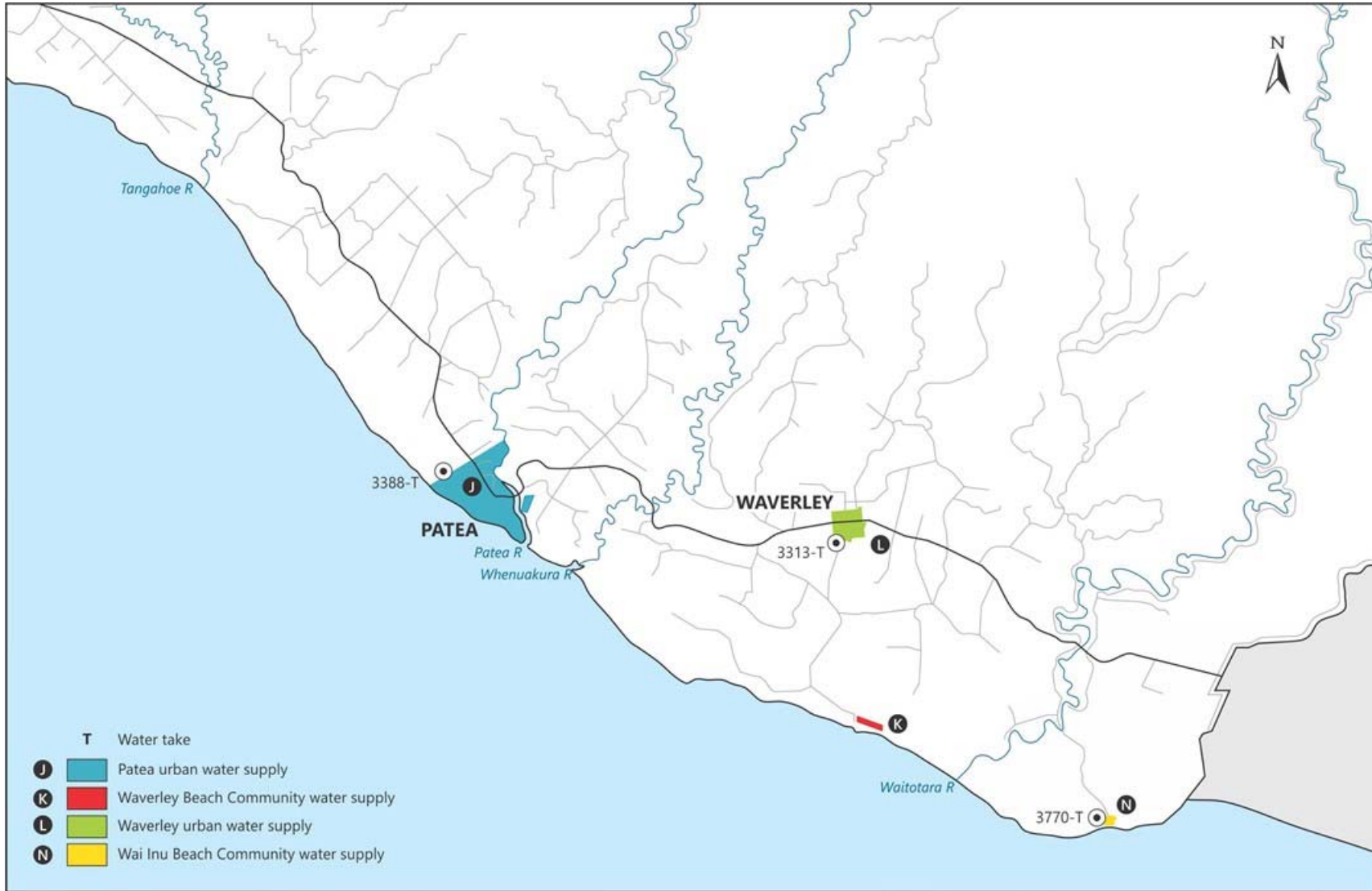
Figure 2 Location of STDC's southern consents