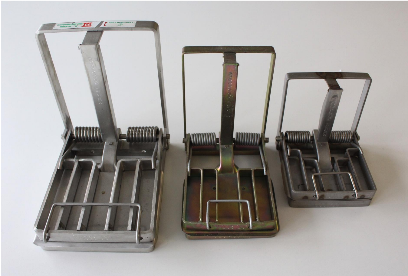
DOC series traps complete. DOC 250, DOC 200, DOC 150. Complete 2004.