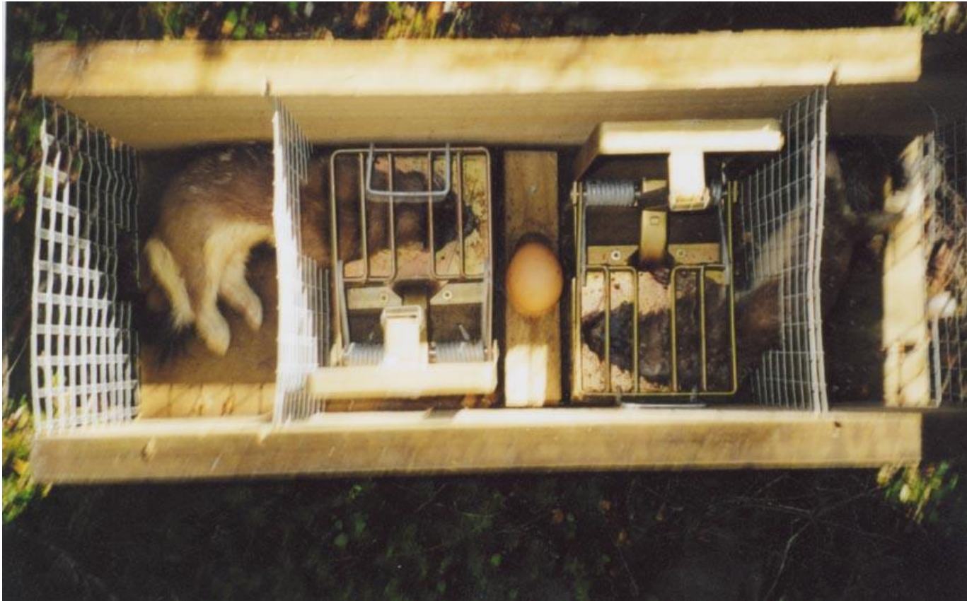
Landsborough Valley. Double stoat.