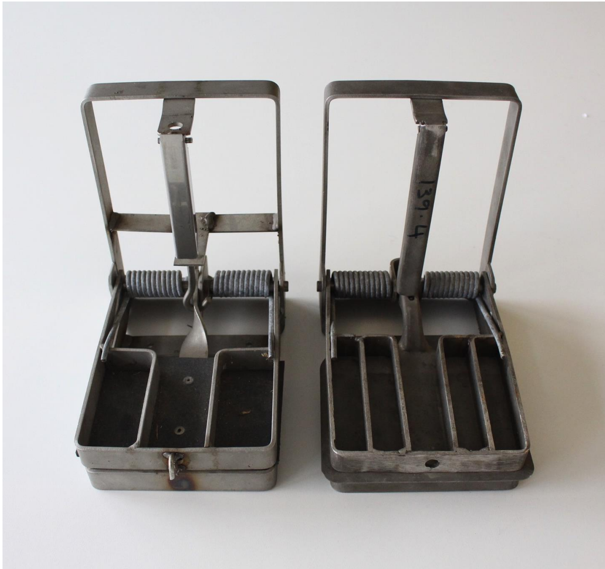
Swedish Potato Masher – DOC 180. (DOC 200 passes NAWAC)