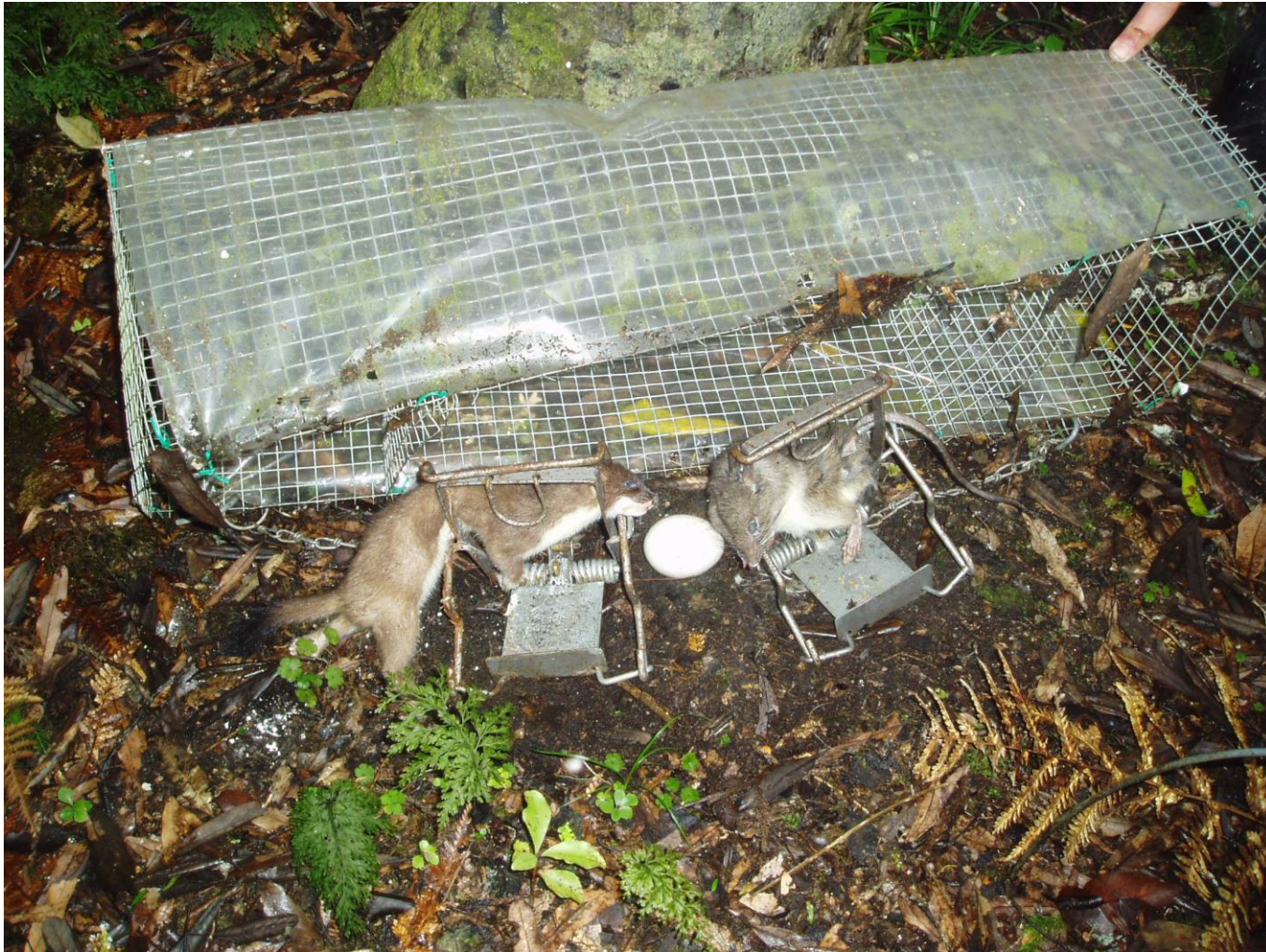
Te Urewera mainland island. Double Mk6 Fenns.