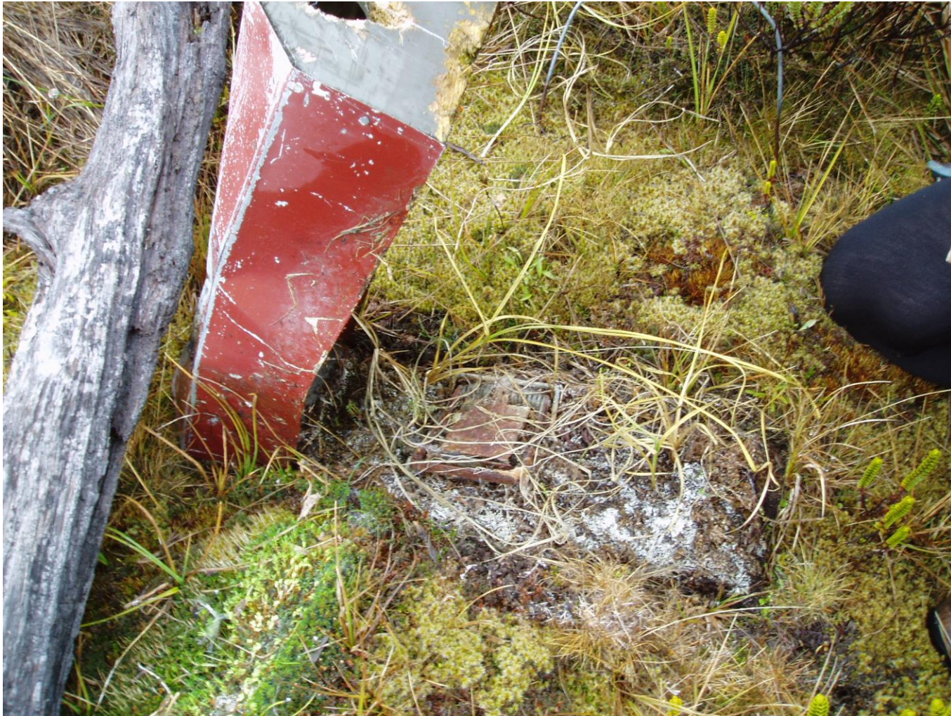
Fenn traps. 1970's – 2000's.