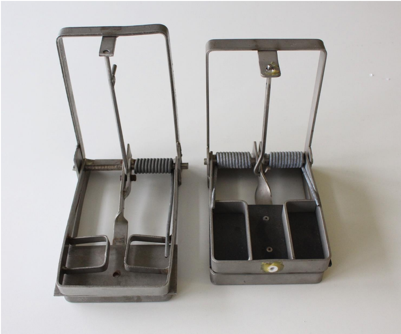
Trapper 90 – Sweden. 2003.