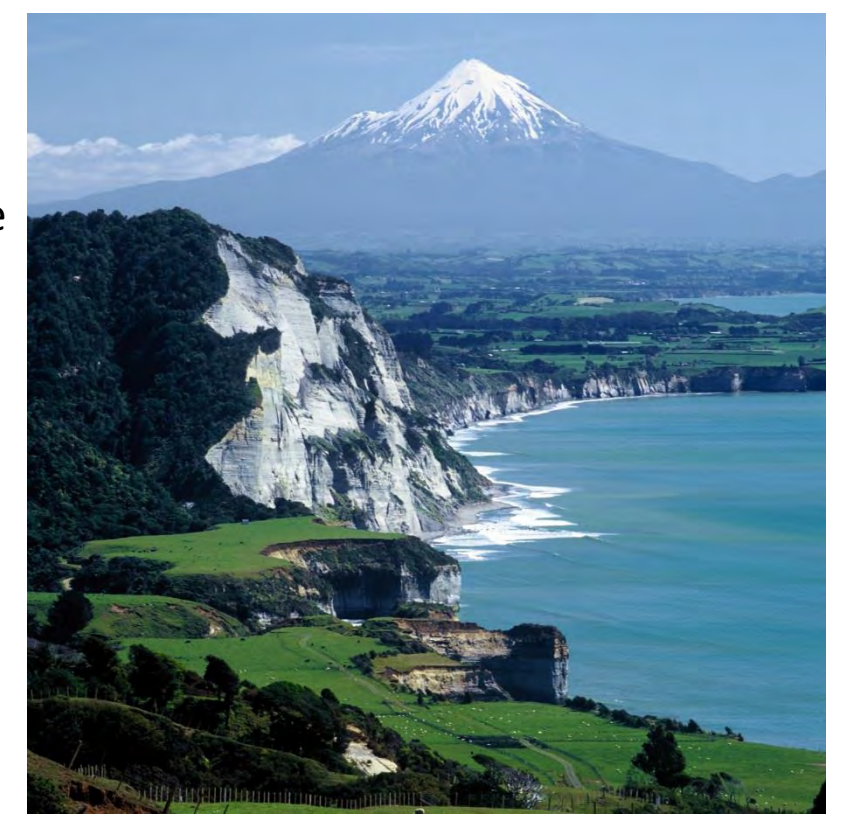
Parininihi Whitecliffs looking toward Taranaki mounga