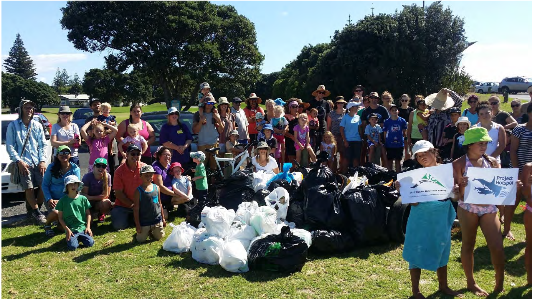
Waitara Beach Clean up 2016