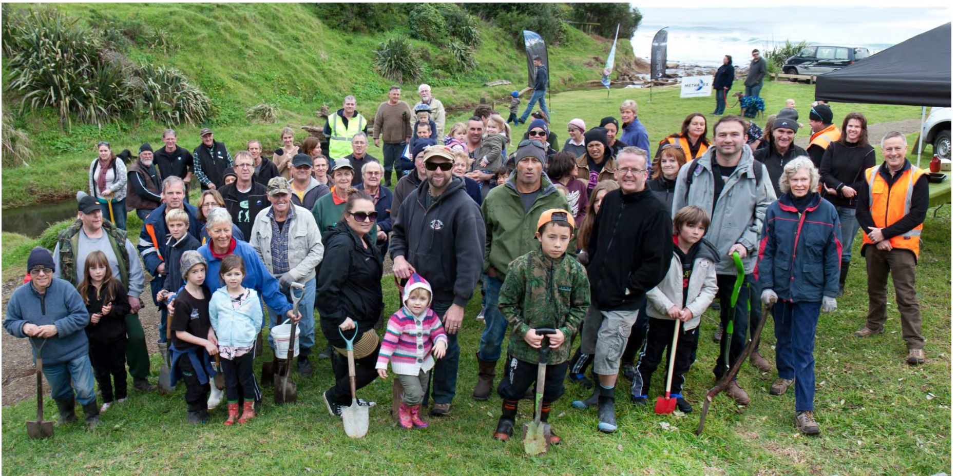
Taranaki Tree Trust - Herekawe Stream restoration project 2013