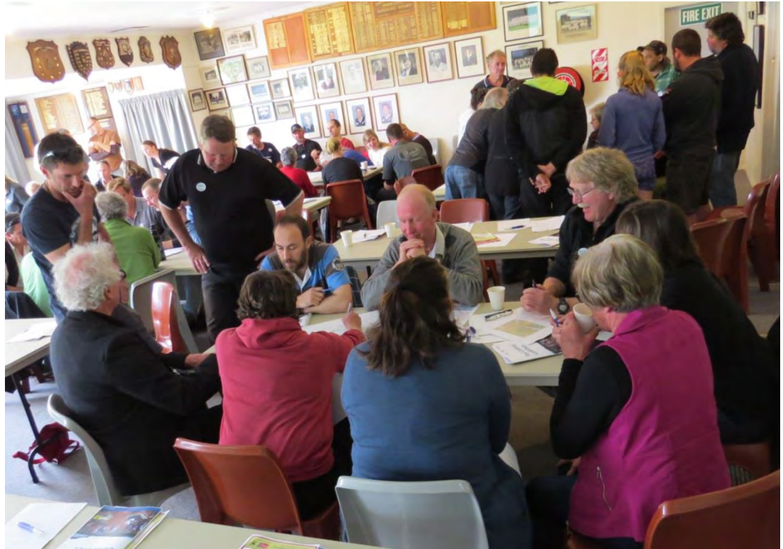
Predator control workshop 2015