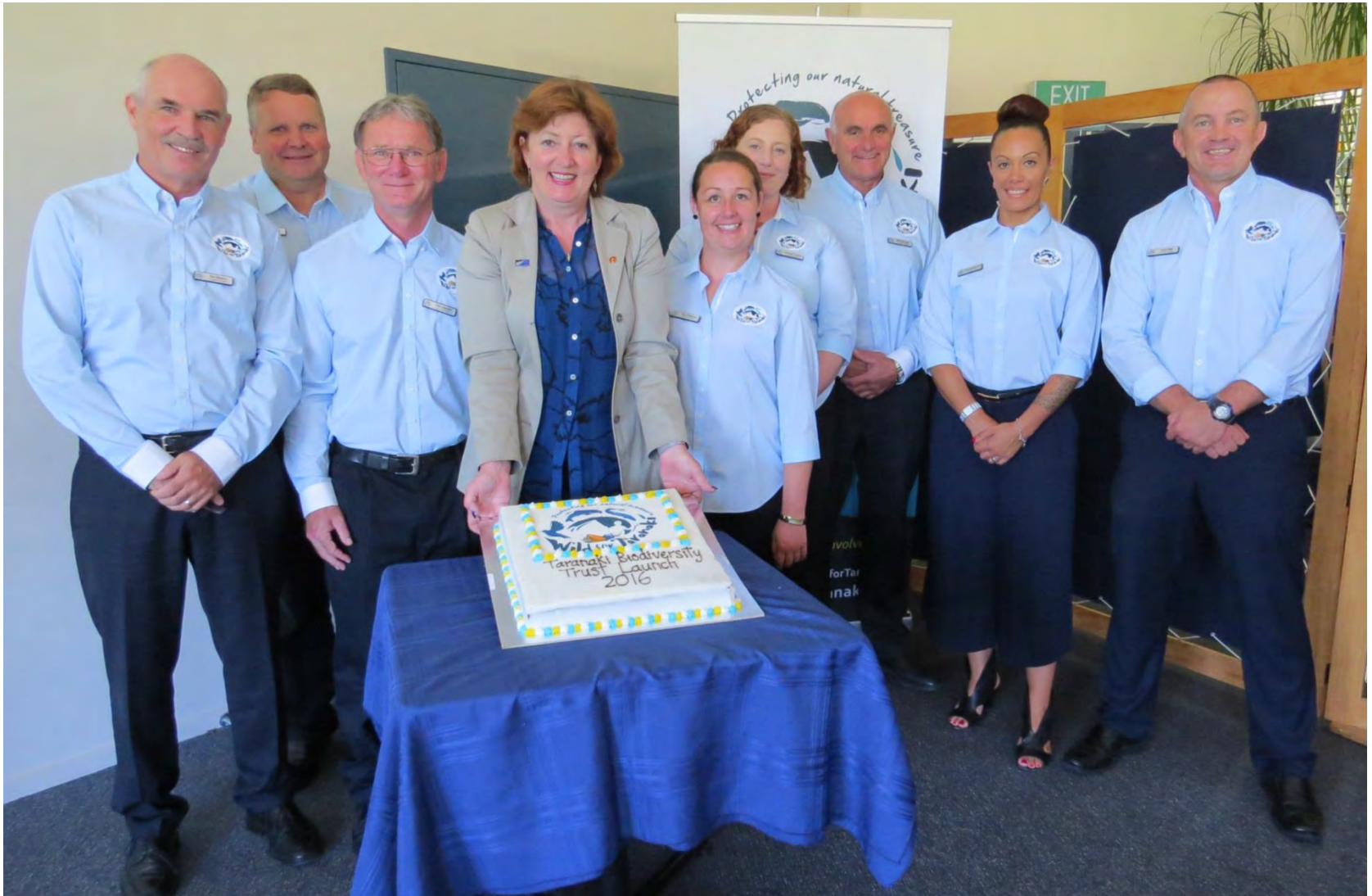
Trust Board with Minister of Conservation at the launch of Wild for Taranaki