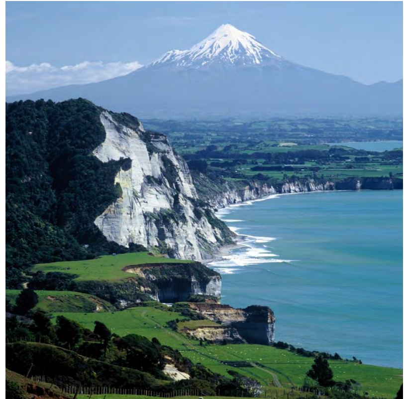
Parininihi Whitecliffs looking toward Taranaki mounga