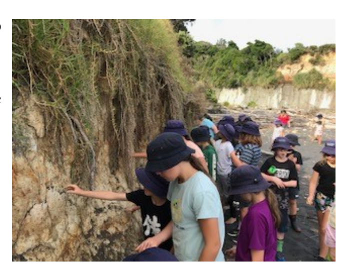
Stratford Primary have formed their SPS Tui's for 2021 and are ready for action! A big group who have their enviro mahi incorporated into their everyday school lives.