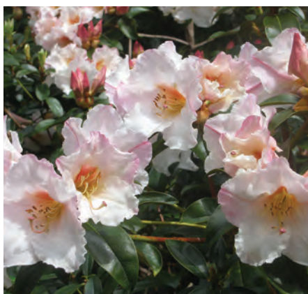
R. 'Floral Gift'