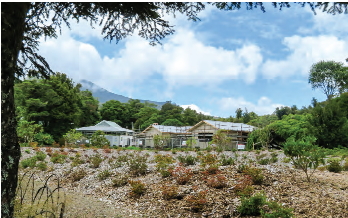
The Lodge takes shape - a view from The Misty Knoll