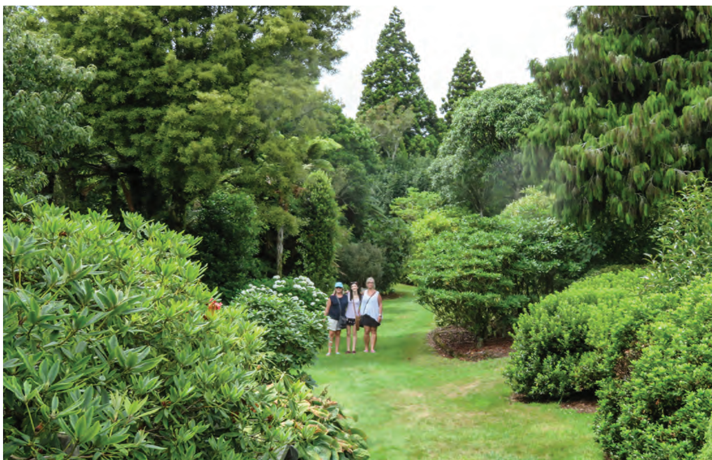
The Hybrid Block in January