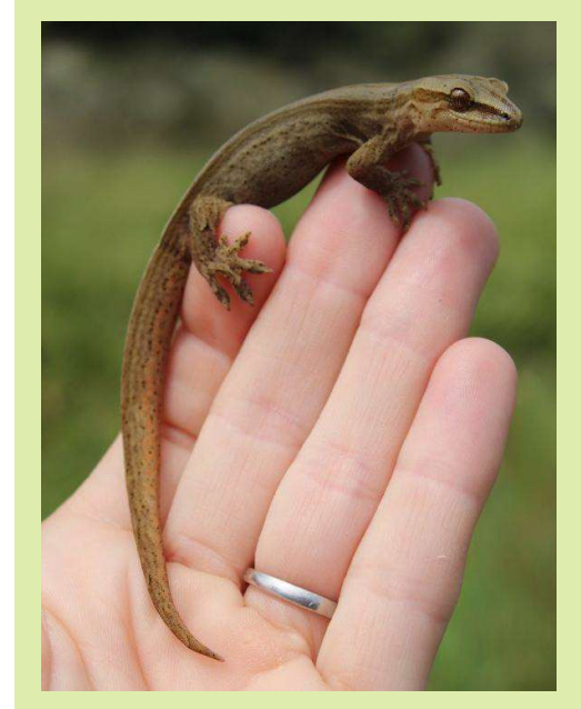
Goldstripe gecko: Largely endemic to Taranaki it is just one of our many threatened species urgently requiring habitat protection.

Identification of your remnant bush, wetland or dune-land as a Key Native Ecosystem does not, in itself, impose any regulatory obligations on your use of the land. Rather it is a non-regulatory way for the Council to prioritise its support to land holders wishing to protect values associated with their site.