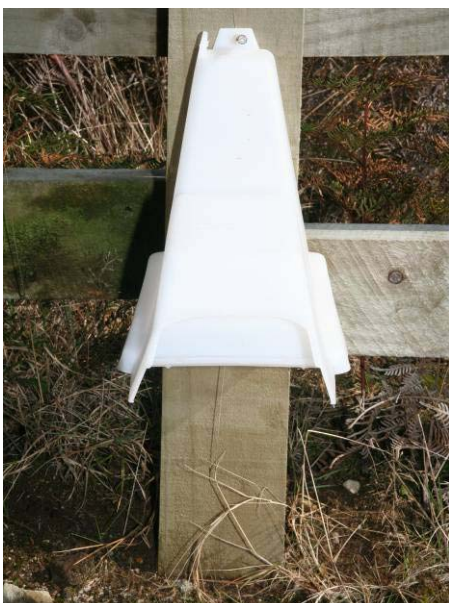
An approved bait station 30 cm above the ground