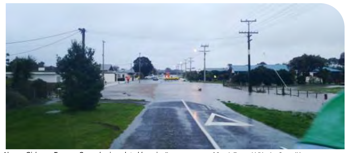
Above: Gisborne Terrace, Opunake, inundated by rain.

It's in two parts: A rural component to divert floodwaters away from the township, and an urban component to upgrade culverts and channels within the township. The urban part will be designed and implemented by the STDC, with the rural component being handled by the TRC. The scheme is designed to protect Opunake from a one-in-100-year (1% probability) flooding event.