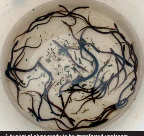
A bucket of elver ready to be transferred upstream past the Patea Dam.