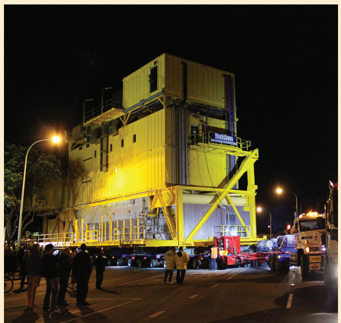
Below: the $35m Yolla Accommodation module, manufactured in Taranaki, for an O&G platform in Australia's Bass Strait.

Taranaki's exploration support also extends to Australia, where the energy and resources industry is rapidly expanding. New Zealand's specialist O&G, and heavy engineering industries – hubbed in Taranaki - are at the forefront of supplying the Australian industry. Large components for O&G fields are designed and constructed in Taranaki before being shipped to Australia - through Port Taranaki and Auckland - while maintenance and other support functions are also undertaken through this regional hub.