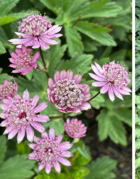
Astrantia major in The Lodge border.