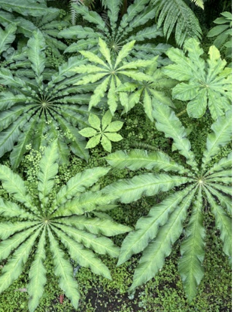
Arisaema taiwanensis in the Vireya House.